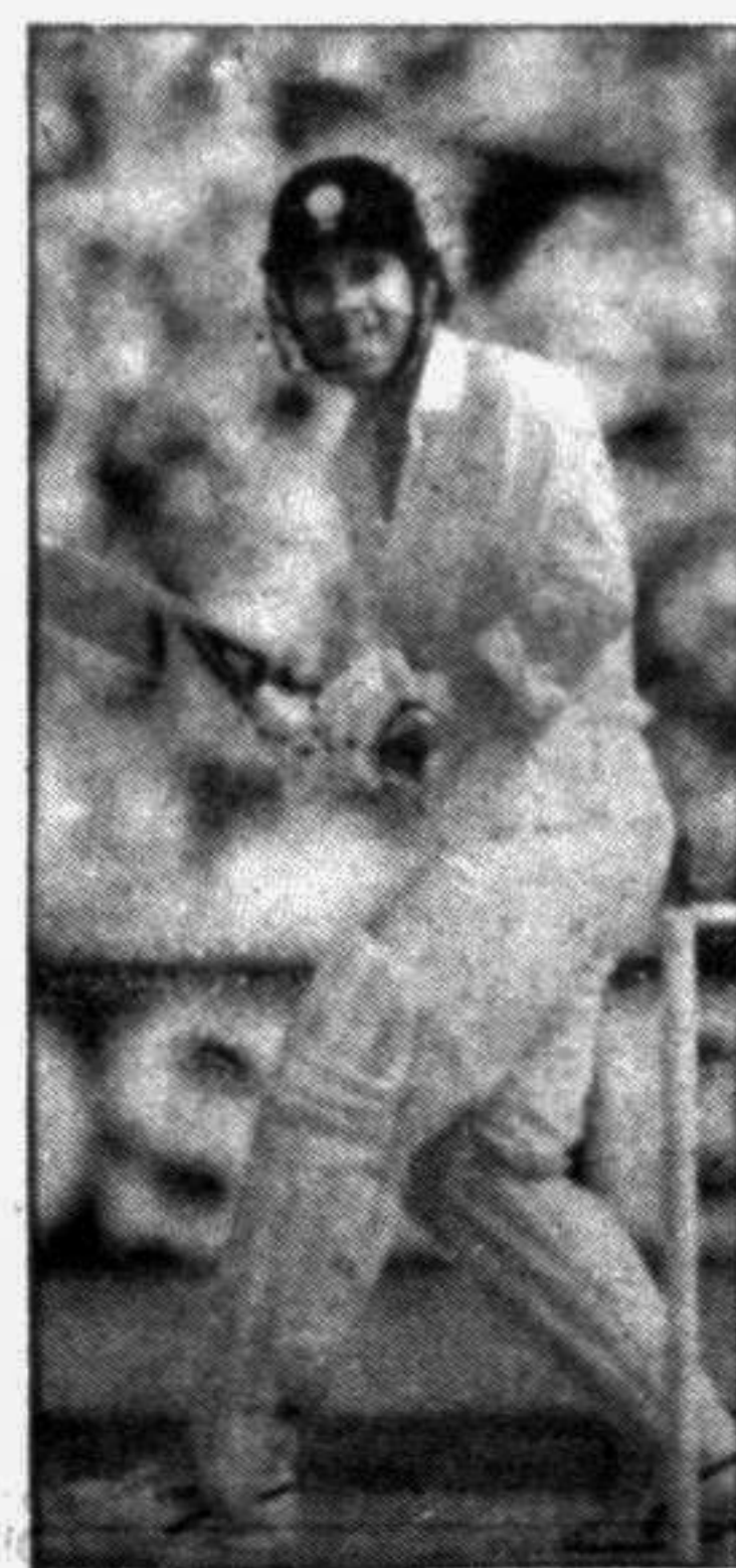
TENDULKAR... 75 n.o

was on the verge of a maiden century but also made an unbeaten 14. A deserved century eluded McMillan who was eventually out hooking at Srinath. He had batted for all but 74 minutes of South Africa's innings after they had been plunged deep in trouble at 26 for four. McMillan was soon in action again with the ball but his first spell was that of a tired man. However, after lunch he appeared revitalised and in a five-over spell took the wickets of Ajay Jadhava (14) and Sanjay Manjrekar (seven) at a personal cost of just two runs. Matthews, having dismissed Ravi Shastri for seven, then had Mohammad Azharuddin caught at slip for nine as India fell to 77 for four. Tendulkar, missed by Matthews off a very sharp chance at third slip off Donald when 10, began to square drive handsomely as the attacked the gaps in the field. He reached 50 in 16 scoring shots with 10 fours and made 40 of a 47-run partner-