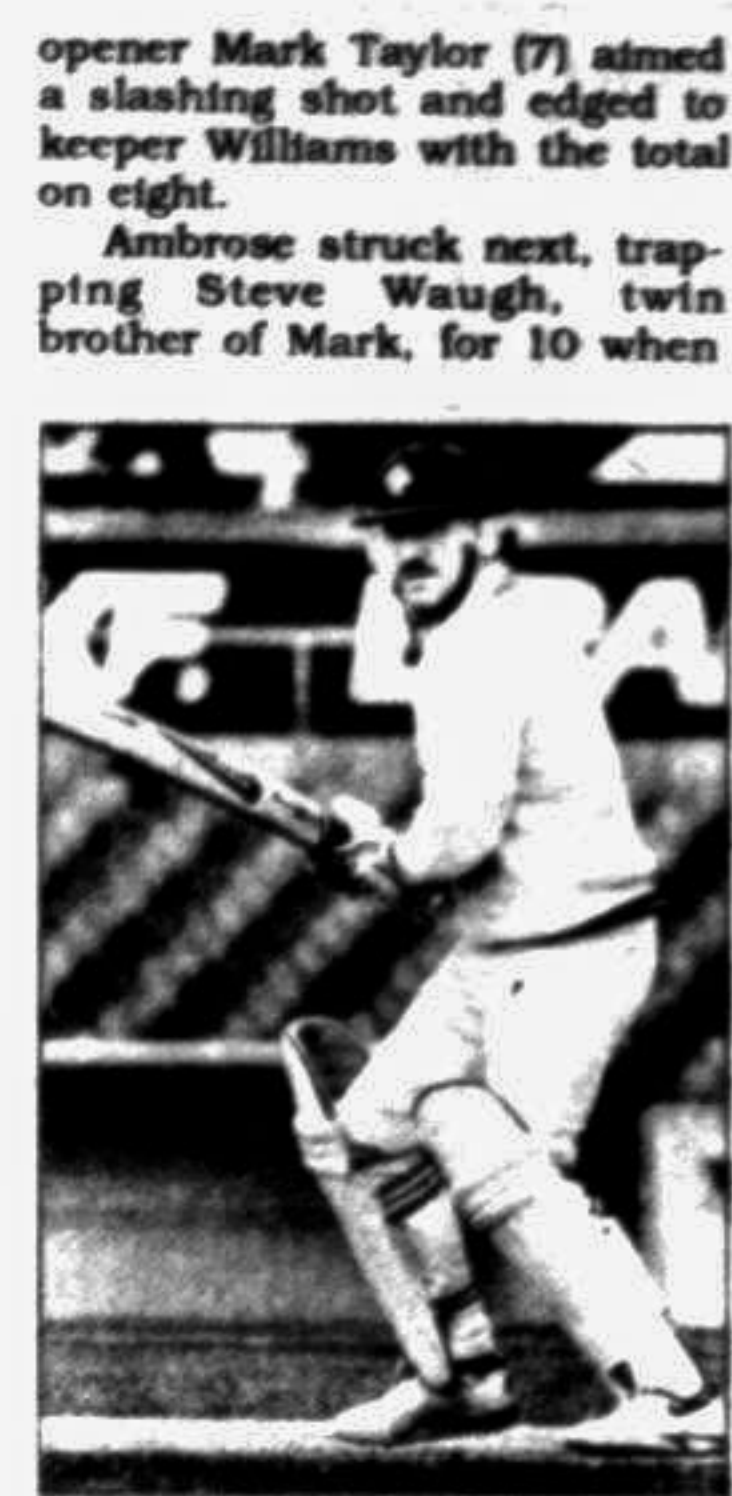
ALLAN BORDER... 73

opener Mark Taylor (7) aimed a slashing shot and edged to keeper Williams with the total on eight. Ambrose struck next, trapping Steve Waugh, twin brother of Mark, for 10 when he gloved a catch to Williams which left Australia on 21 for two. Opener David Boon, hitting aggressively, was joined by Mark Waugh and the pair looking capable of performing a useful salvage job. But Hooper with his fifth ball of the first over after lunch, held on to a fierce return catch to send back Waugh for 39 with the total 88. Hooper then induced Boon (48) to pop up a catch off bat and pad to Phil Simmons at forward short leg, leaving much on the shoulders of Border and the raw 21-year-old Damien Martyn, making his Test debut after some scintillating innings for Western Australia at state level. But Martyn (36), having looked solid, swung at a wide and loose delivery from Ambrose and was caught in the slips by Brian Lara. It was Ambrose's 150th wicket in 35 Tests. Border was lucky to survive when Keith Arthurton missed an easy run out and later when Williams lost sight of a strike which Lara just failed to take at first slip. In his 134th Test, Australia's captain stayed put, making the most of his good fortune to continue his fine record against West Indian pace bowling. A slightly wayward Patrick Patterson was a particular disappointment, conceding 73 runs off 14 overs, including five no balls.