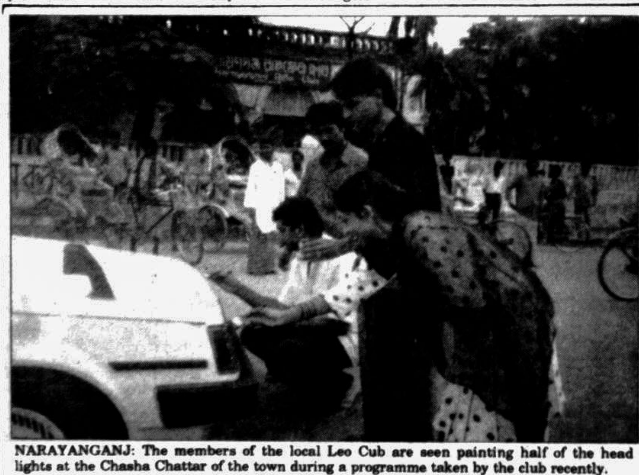
NARAYANGANJ: The members of the local Leo Cub are seen painting half of the head lights at the Chasha Chatter of the town during a programme taken by the club recently.