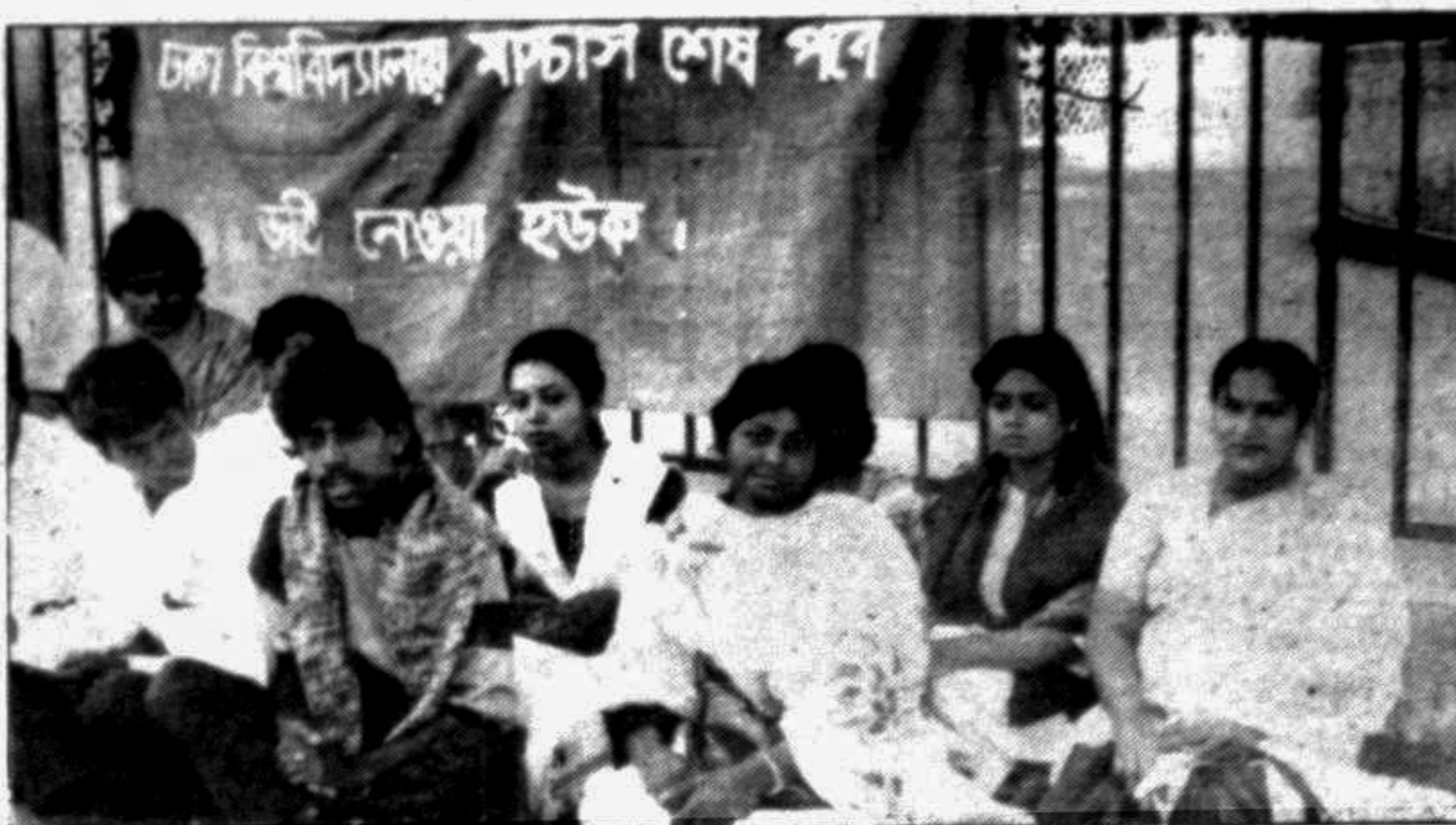
The admission seekers in the final year Dhaka University Masters degree course under the traditional system went on token hunger strike in front of the Jatiya Press Club yesterday.