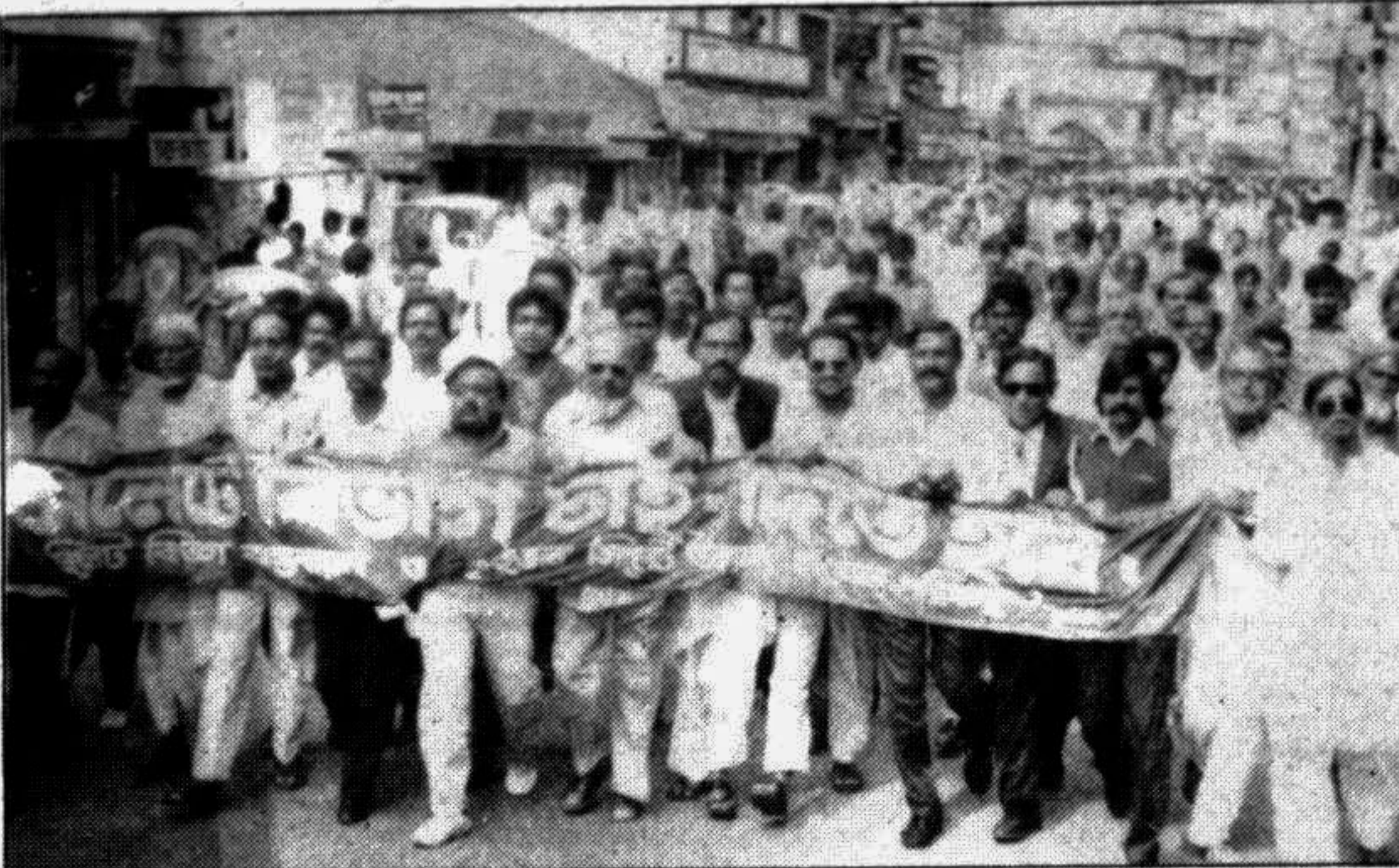
SYLHET: The Sylhet Division Implementation and Greater Sylhet Development Council brought out a procession at the town to press home the demand for formation of Sylhet Division comprising the districts of Sylhet, Maulvibazar, Sunamganj and Habiganj on November 19.

A case was lodged with the local police in this connection.