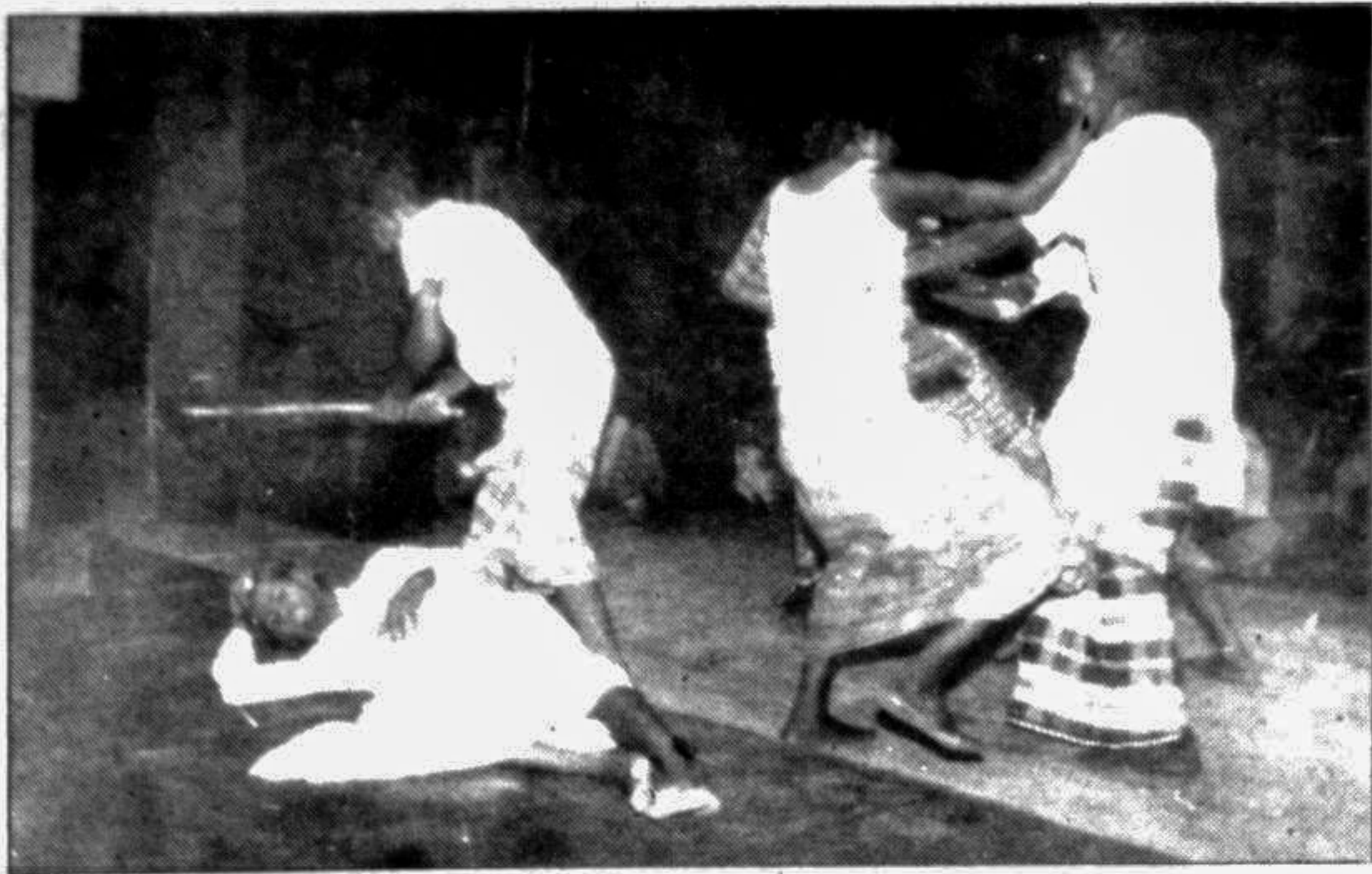
Theatre — mouthpiece of resistance

A military dictator was in power. All the usual restrictions were in force. But in a dark theatre of the capital city, people sat rapt in approving attention as actors on stage made pointed, blatant fun of the president and his childless marriage, his bloated self-importance and his fanatic sycophants. "Saat ghatar kanakori" was a hit.