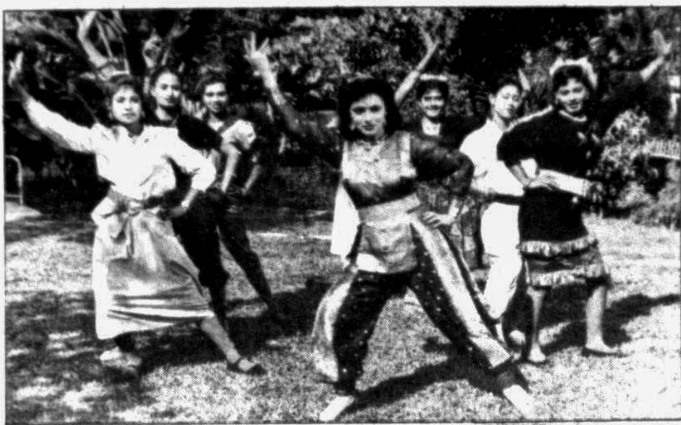
Commercial films: where art doesn't stand a chance.

Once upon a time, the movies meant a magic world where the doe-eyed beauty won the heart of the faithful young man while terrifying villains gnashed their teeth and hummable tunes accompanied the whole thing. But Bangladeshi cinema has come a long way since those days.