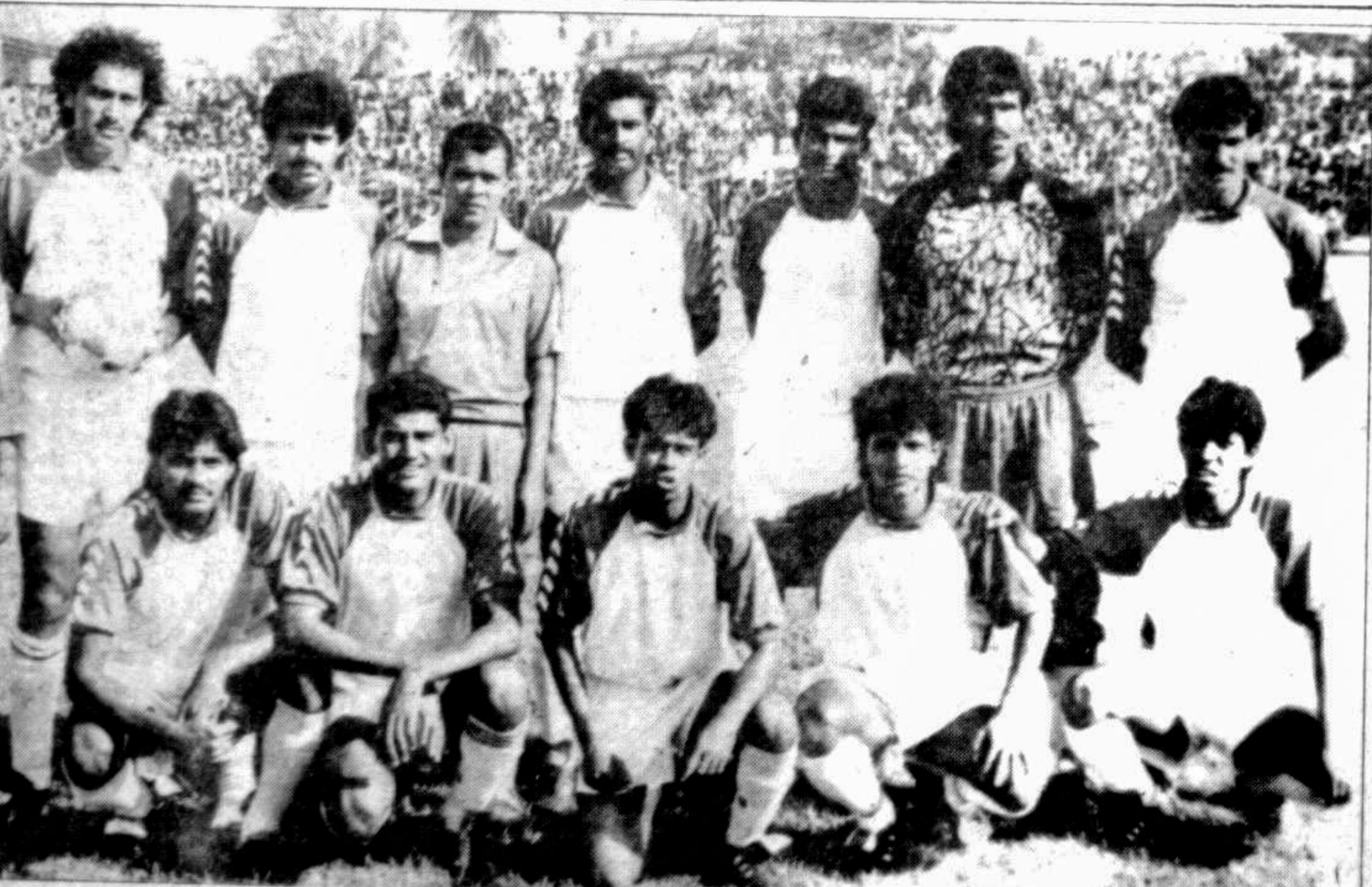
Champions Dhaka University who beat Khulna DSA to lift the national soccer title yesterday at the Mymensingh Stadium.