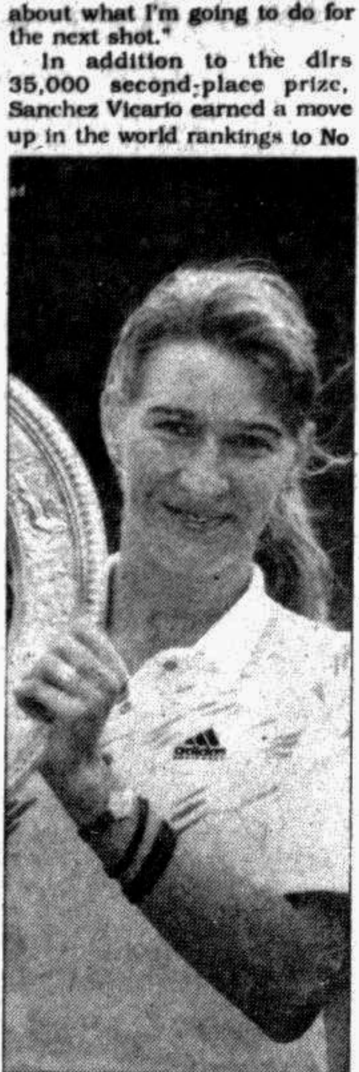
STEFFI GRAF 4, passing Martina Navratilova. Graf, ranked No 2 behind Monica Seles, hasn't lost a match since the US Open, when Sanchez Vicario beat her in the quarterfinals. Since, she

PHILADELPHIA, Nov 16: Winning four tournaments in a row isn't enough to satisfy Steffi Graf. It's a matter of standards, reports AP. The four-time Wimbledon champion fought off Arantxa Sanchez Vicario 6-3, 3-6, 6-1 Sunday in the dlr 350,000 Virginia Slims of Philadelphia. Afterward Graf talked mostly of shortcomings: too slow, too meek, too far from the net. Never mind the dlr 70,000 first-prize check. "When I'm not playing up to the standards I wish I would, I'm not satisfied, even if I win," Graf said. After a week of demolishing three players in less than an hour each, the 23-year-old German faced a tenacious competitor who didn't mind a long hard chase from side to side. In the 22-point third game of the second set, Graf had five chances to break Sanchez Vicario's service. Twice she hit forehands out, once she hit a backhand out and twice the 20-year-old Spaniard fired two-handed backhands down the line. "She has a very good instinct for where the ball's going to go to," Graf said. "She knows very well. That's why she's very dangerous." Sanchez Vicario said she was happy with her game and had tried to slow down the match instead of letting Graf set the pace. "She is a player who rushes a lot," Sanchez Vicario said. "I like to take my time and think