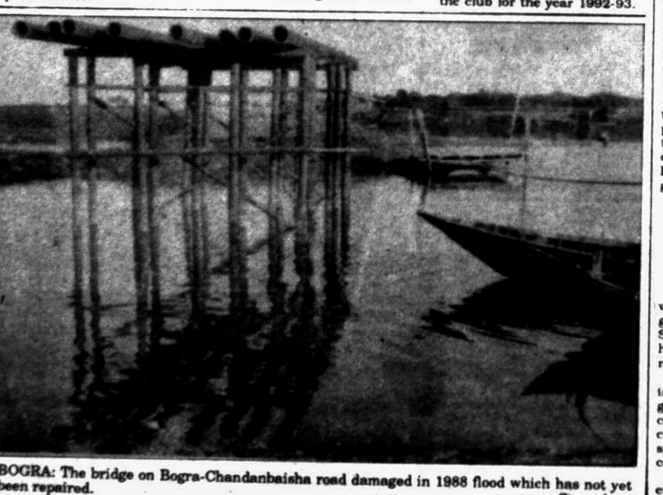
BOGRA: The bridge on Bogra-Chandanbaisha road damaged in 1988 flood which has not yet been repaired.