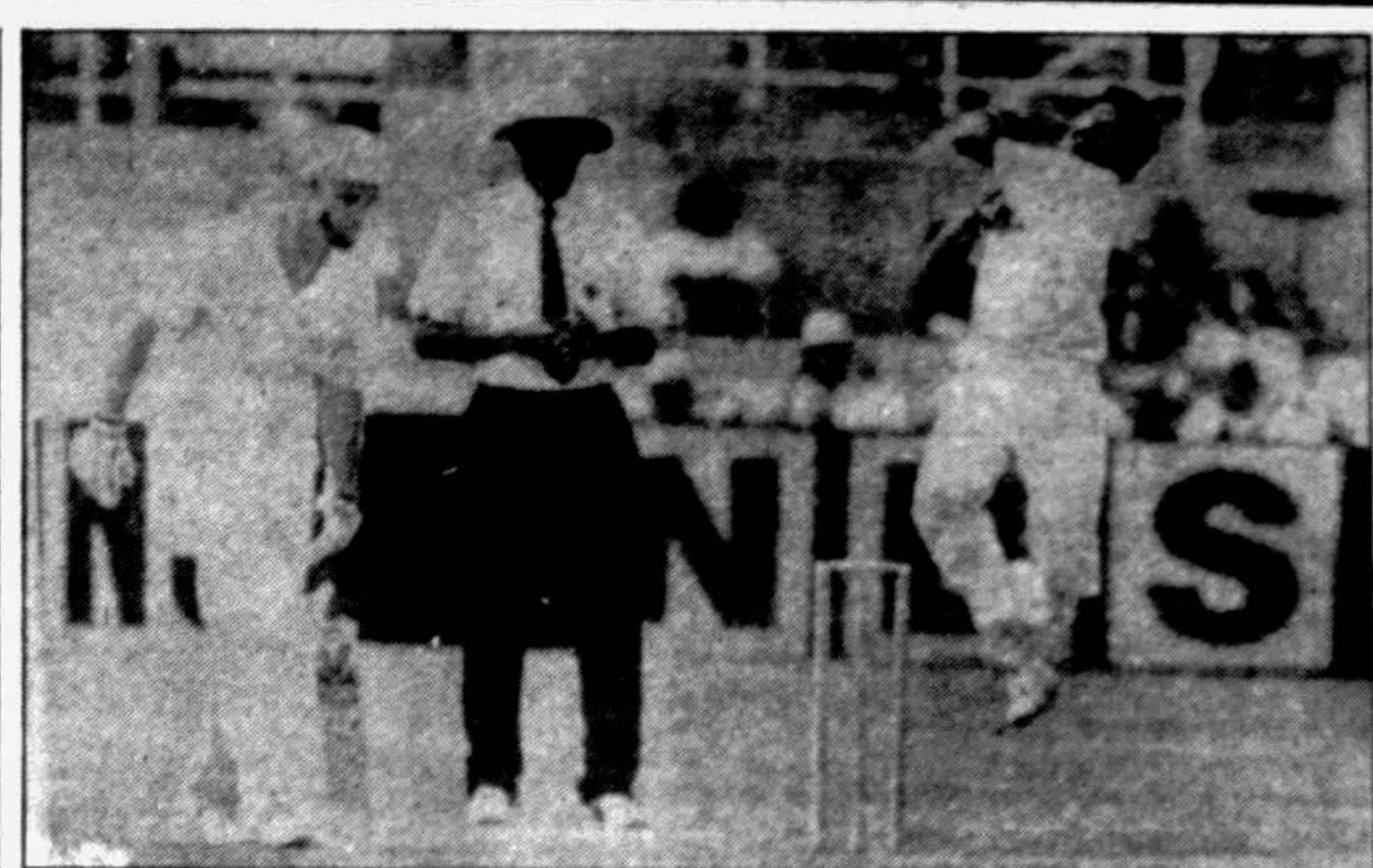
Kapil Dev (R), the Indian all-rounder, bowls to South Africa's Jonty Rhodes in the first cricket Test in Durban on Friday. South Africa batted first scoring 215 runs for the loss of 7 wickets at the end of the first day's play.

Squad: Javed Miandad (captain), Rameez Raja, Salim Malik, Amir Sohail, Inzamamul Haq, Wasim Akram, Asif Mujtaba, Waqar Younis, Naveed Anjum, Aaqib Javed, Mushtaq Ahmed, Aftab Rehman, Rashid Latif, Saeed Anwar, Shahid Saeed.