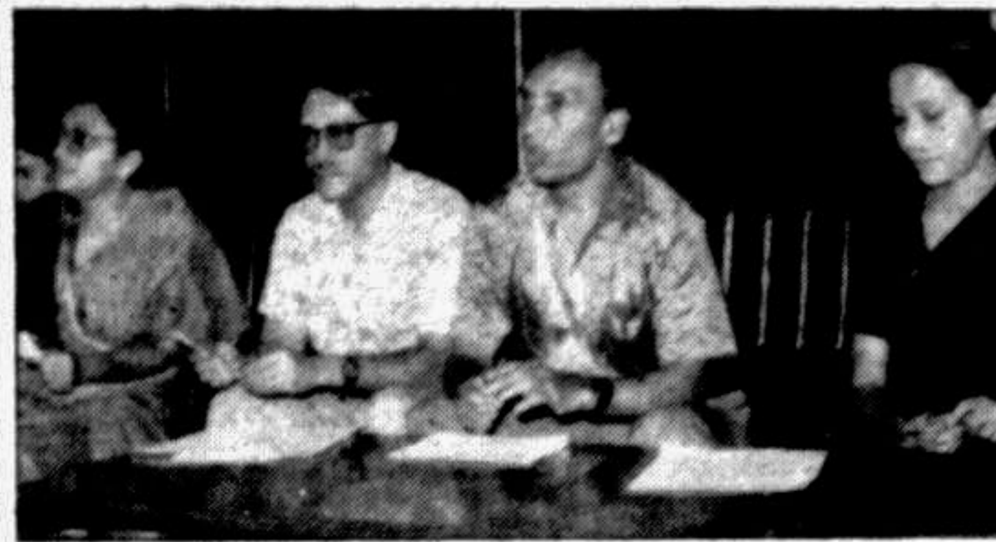
A group of social workers holding a press conference yesterday at National Press Club on the eve of World Bank chief's arrival in the city.

He said, the government is taking allout efforts to spread education and improve its quality and standard.