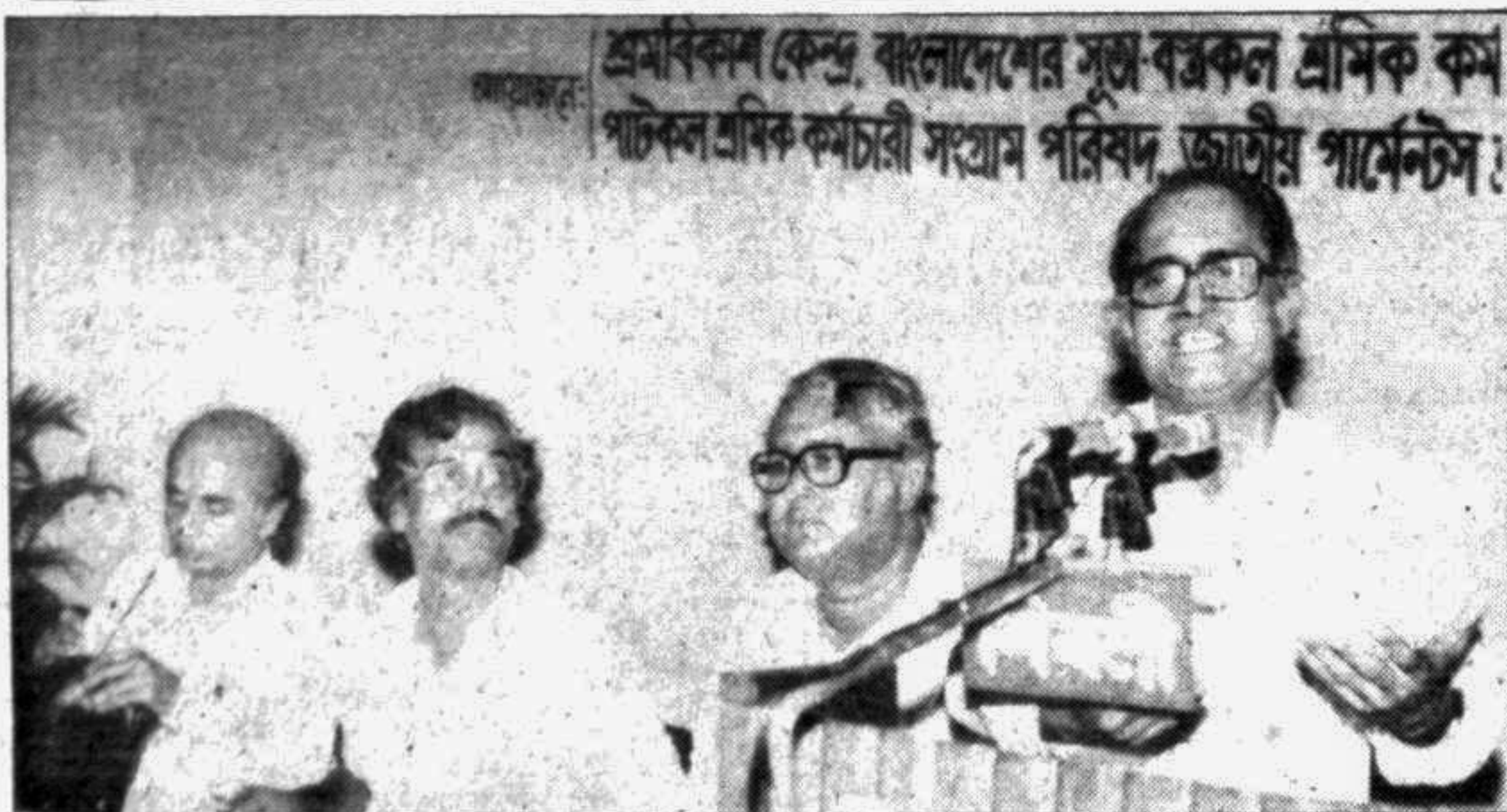
A discussion meeting was held on World Bank's policy in the industrialisation of Bangladesh organised by different workers' organisations at Press Club auditorium yesterday. (Story on Page 12)