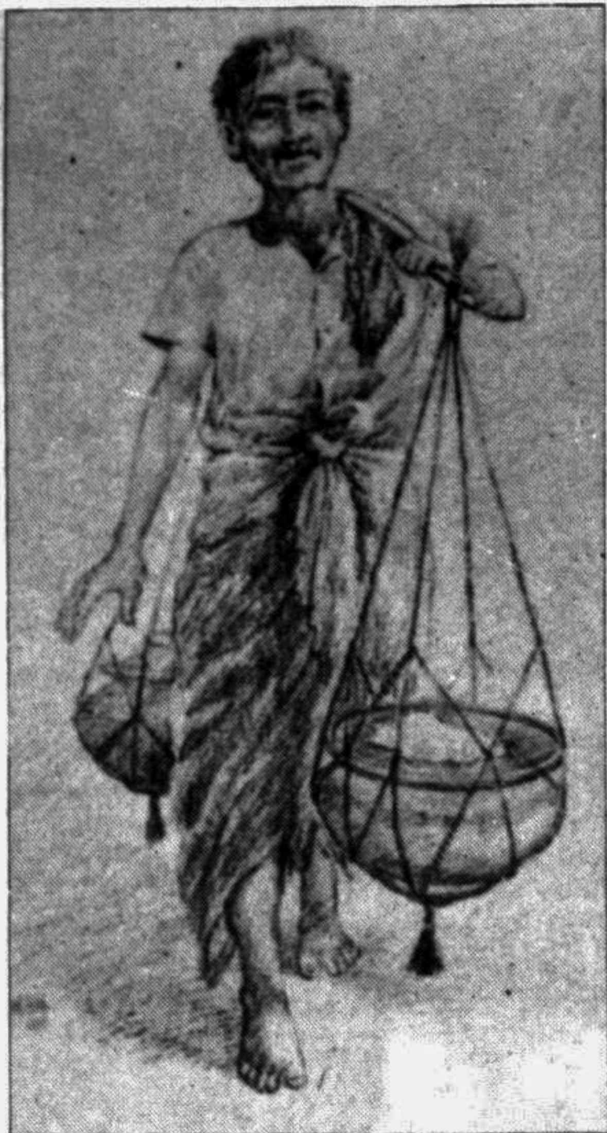
Butter Milk & Sweet seller (Drawing on paper)

Hai has participated in numerous group exhibitions at home and abroad, and is also, incidentally, a reputed singer and composer of lyrics.