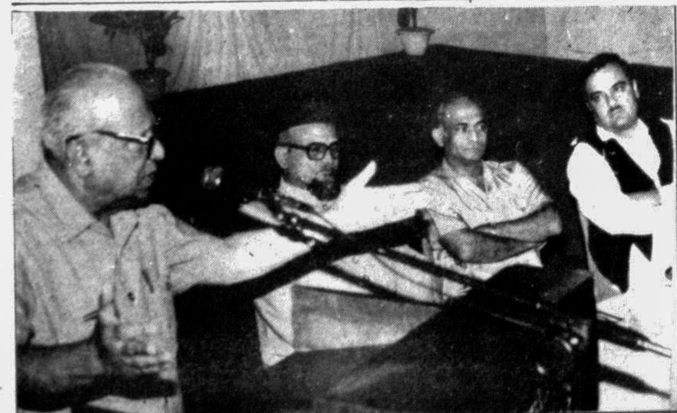
The Secretary General of Motamar Ali Alam Al Islami (World Muslim Congress) addressing the meeting at a city hotel yesterday.