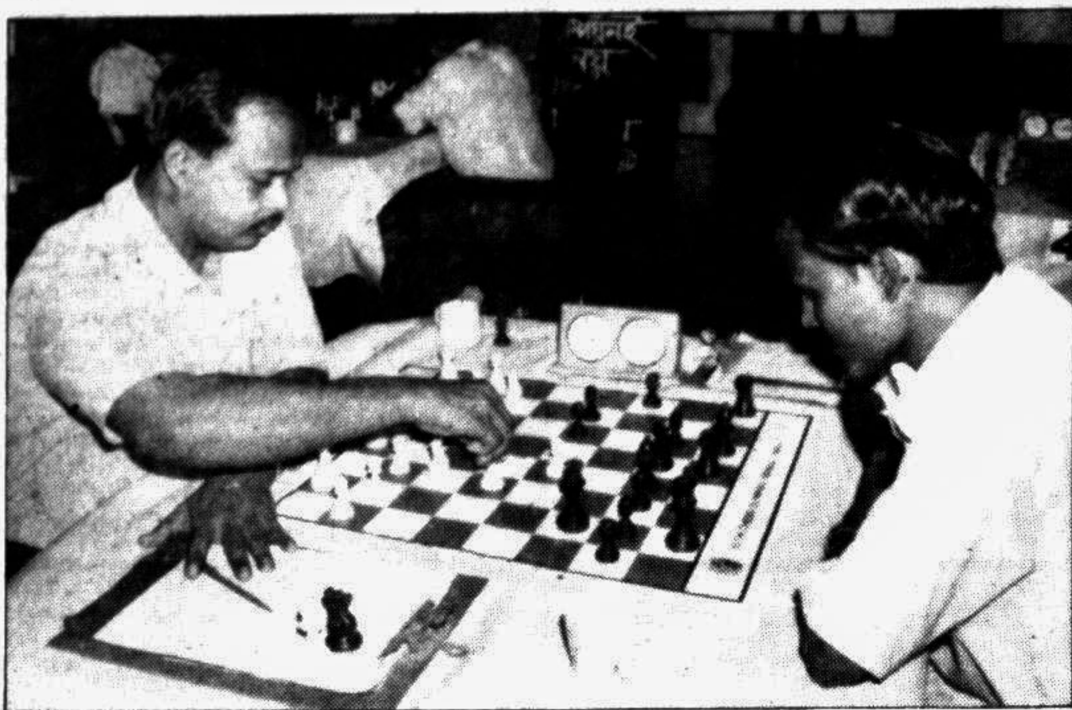
Scene from the sixth round of the second Prantik International chess tournament now being played in the chess room of the NSC.