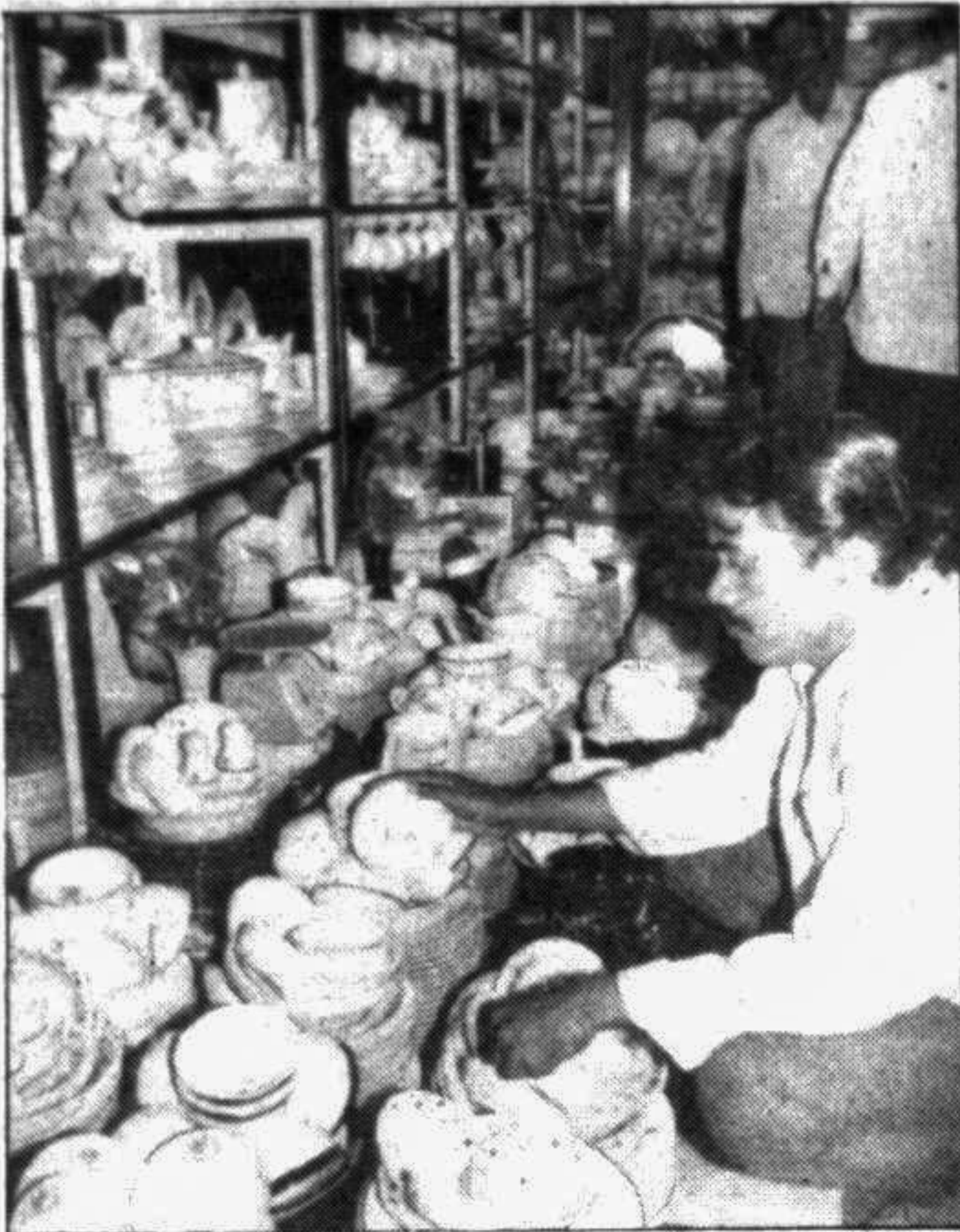
Too hard to believe these are local products.