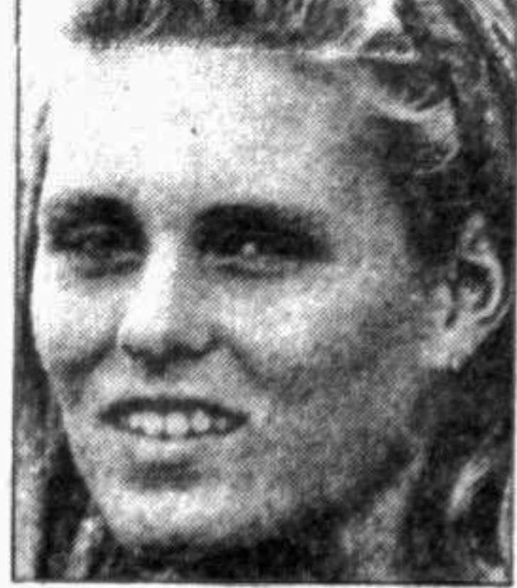
KATRIN KRABBE into Germany and the Krabbe, Breuer and Derr cases. Clenbuterol has been used as a stimulant to treat asthma but it has also been used as anabolic steroid, where it has been particularly effective in producing muscle bulk in cattle.

the underground steroid handbook notes that elite track and field athletes have also used Clenbuterol for several years.