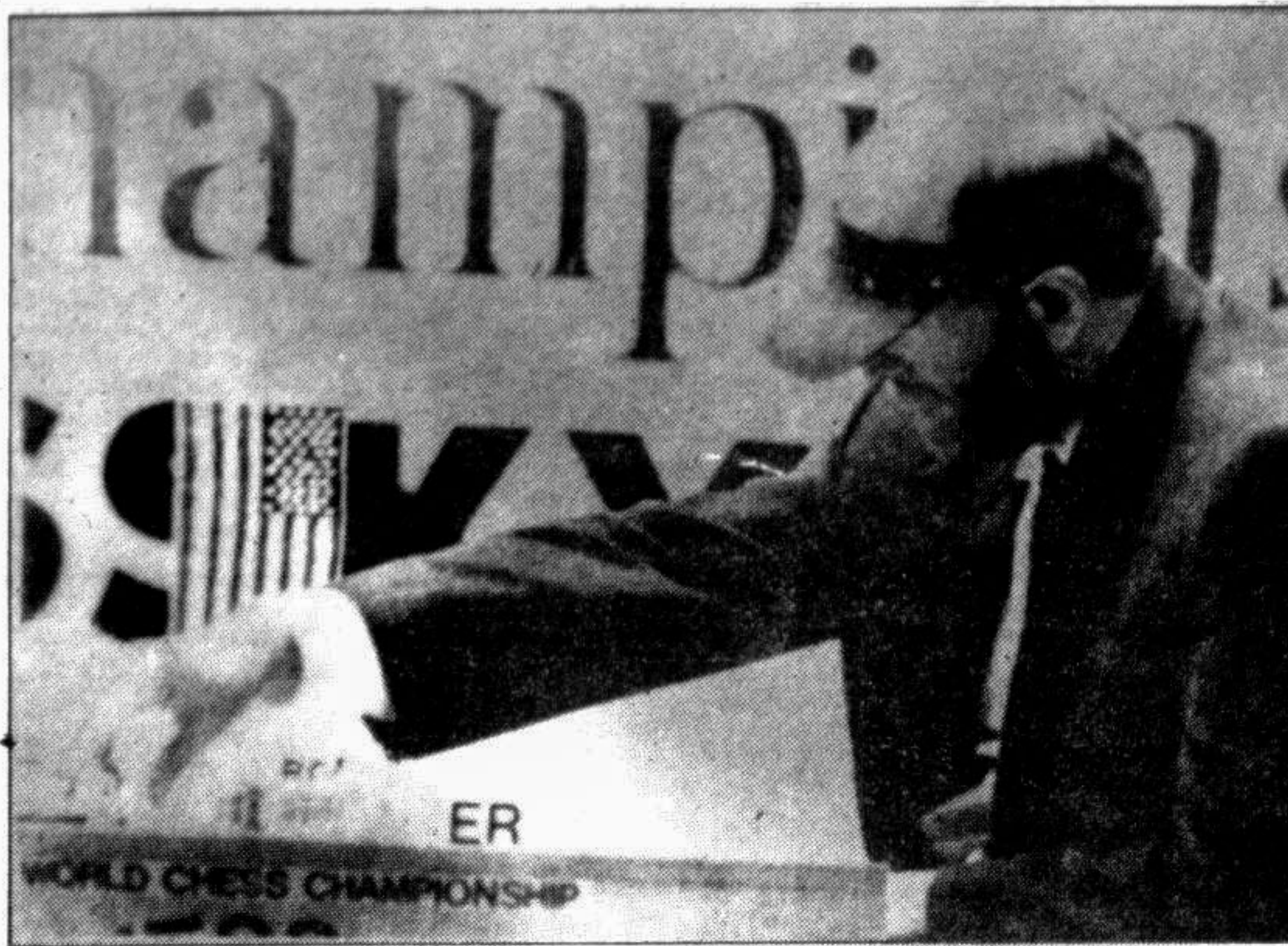
Bobby Fischer makes his first move for the 27th Game of the match for their world chess championship against Boris Spassky in Belgrade on Saturday. Fischer leads 9-5.

Sports Reporter The first Ali Sports Cup juvenile football tournament will begin from November 4 at the Hazaribagh Park ground with Ganaktuli Kishore XI (Red) taking on Lalbagh Noor Sporting Club, says a press release.