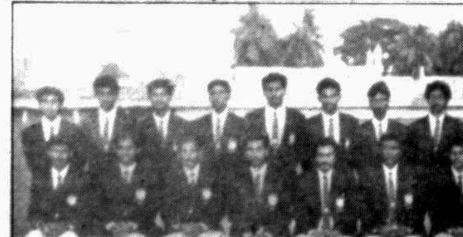
Players and officials of the Dhaka Hockey Eleven who left for Jalandhar to take part in the ninth All India Surjeet Singh memorial hockey tournament scheduled for Nov 3 to 13.