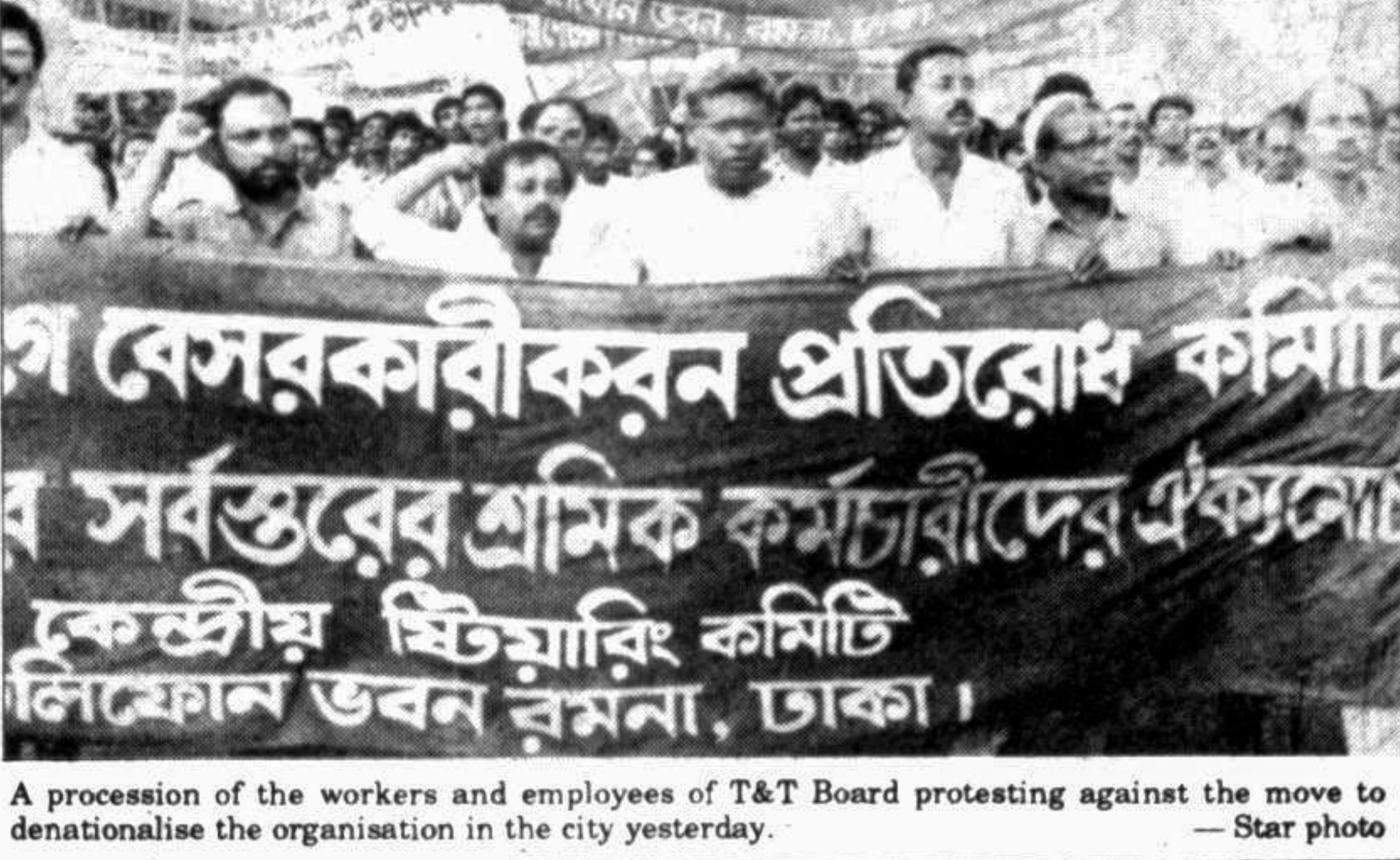
A procession of the workers and employees of T&T Board protesting against the move to denationalise the organisation in the city yesterday.