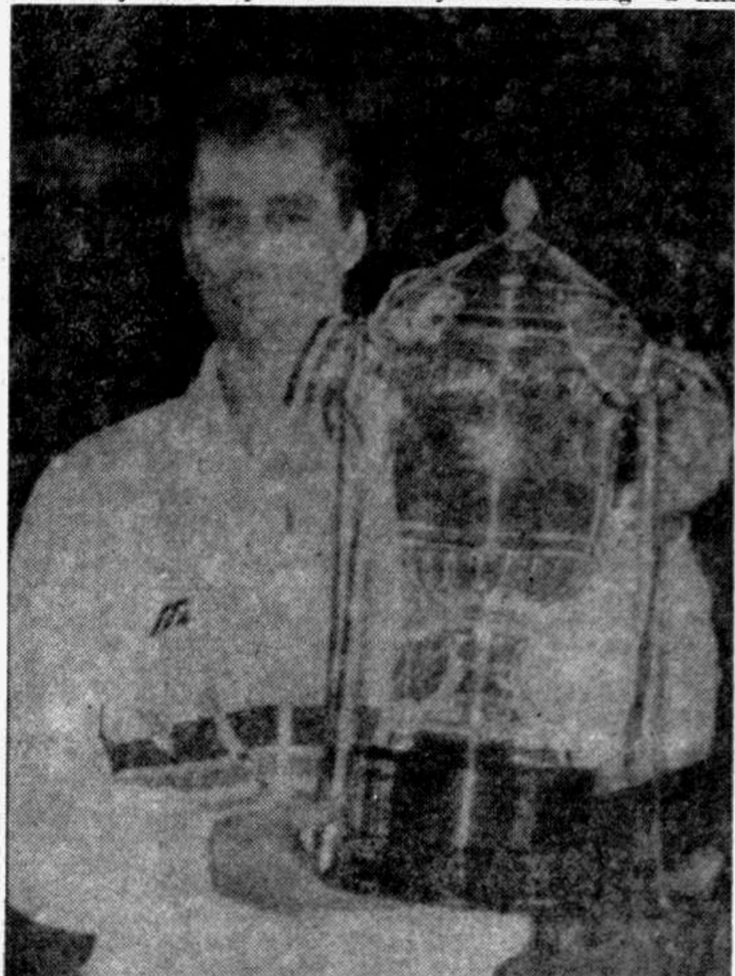
Czech-born American Ivan Lendl smiles while holding the trophy after defeating compatriot Michael Chang in the final of the $ 640,000 Marlboro Championships in Hong Kong yesterday. Lendl won 6-3, 4-6, 6-4, 6-4.

He also was appointed patron of the Hong Kong Tennis Foundation, which seeks to develop junior tennis in the British colony.