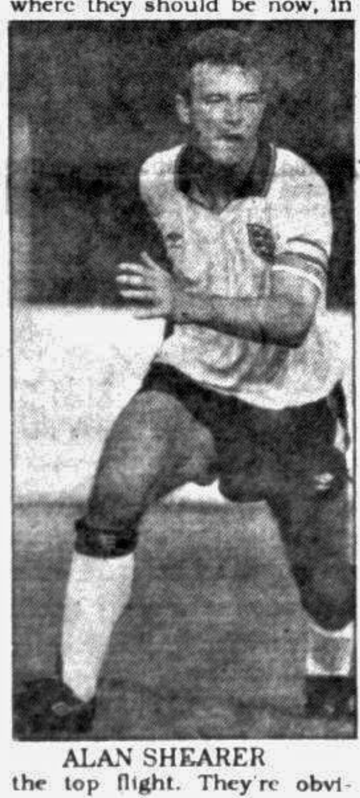
ALAN SHEARER the top flight. They're obvi-

LONDON, Oct 23: Alan Shearer, Britain's most expensive footballer, can show Manchester United what they missed when Blackburn attempt to regain the leadership of the English Premier League at Ewood Park on Saturday, reports AFP. Seventh-placed United were one of the clubs chasing the England striker before he left for Southampton, but he opted for their unfashionable Lancashire neighbours in a 3.4 million-pound transfer and has not stopped scoring since. United Director Bobby Charlton, who scored in the clubs' last league game at Blackburn in May 1966, said of the 15-goal forward: "I'm pleased he's doing well. If he does as well for England, then it is doubly good." The England legend is equally pleased to see Blackburn back in the big time after a long and sometimes painful absence of 26 years. "Blackburn are a big club with a great history and a long