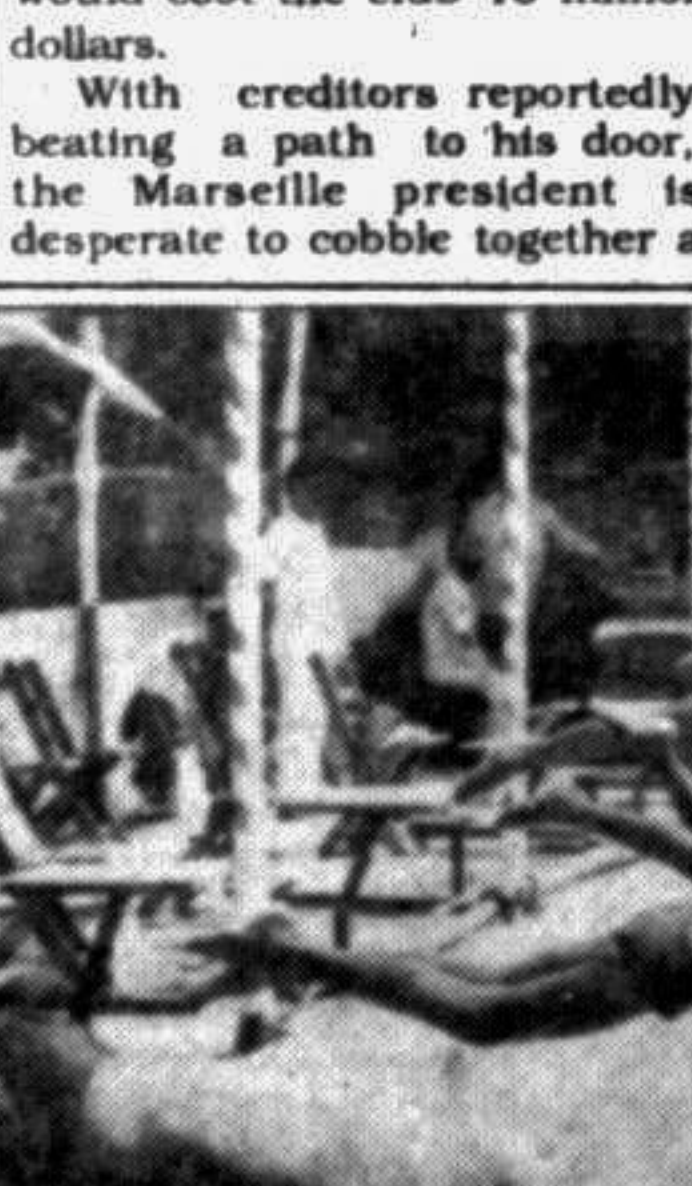
Swimmers between 13 to 14 years of age start their 50m freestyle race at the Dhanmandi Women's Complex pool yesterday.