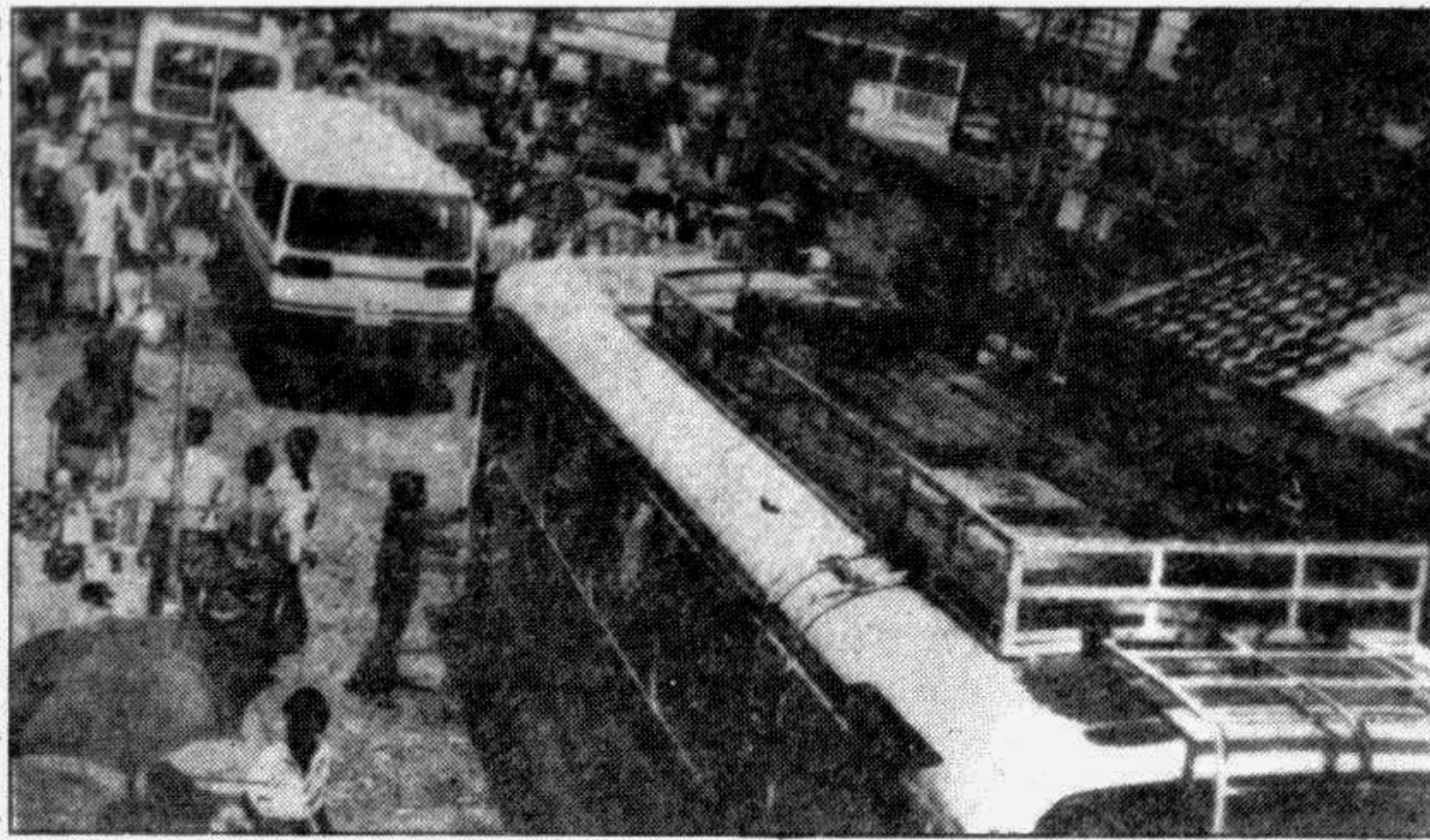
SYLHET: The long-route coaches are seen parking on the main road at Bhathakhola area haphazardly which creates much inconveniences to other vehicles and pedestrians.

From Our Correspondent Oct 23: A dacoity in minibus was committed near at village Puropara recently on Chuadanga-Darsana bus route about six miles off from here.