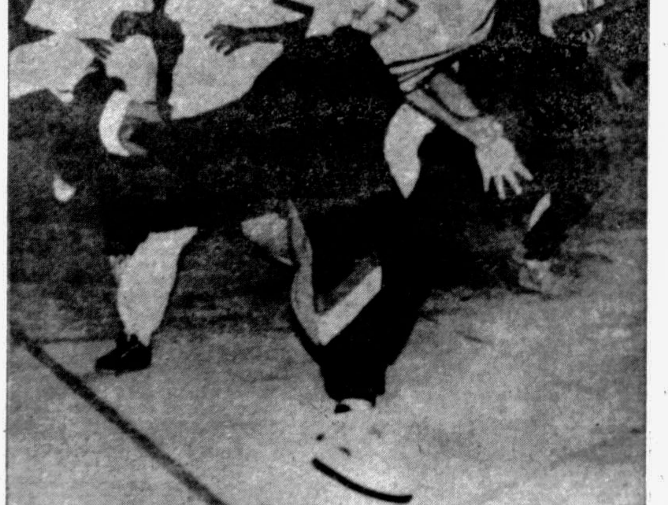
Action from yesterday's schools handball tournament for girls between Viqarunnessa Noon School and Mohammadpur Preparatory School at the Dhanmondi Women's Complex yesterday. Viqarunnessa won 19-4.

Argentina play the Saudis today for the King Fahad Trophy.