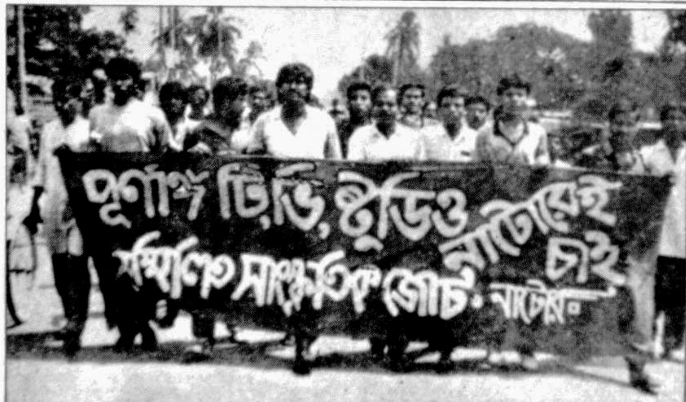
NATORE: The local Sangekritik Jote brought out a procession recently demanding a fullfledged TV station.

From Our Correspondent COX'S BAZAR, Oct 19: Pye-dog menace has become alarming over the last three months in different areas of the district. According to reports, the pye-dogs with the advent of rainy season have taken shelter in different localities and in hats and bazars of the district posing a great problem to the people. These pye-dogs now confined in the high land and bazars frequently bite the people especially the children, it is learnt. The victims to encounter the dreadful consequence of dog biting move here and there including the district headquarters to procure ARV but in vain. In view of the circum-