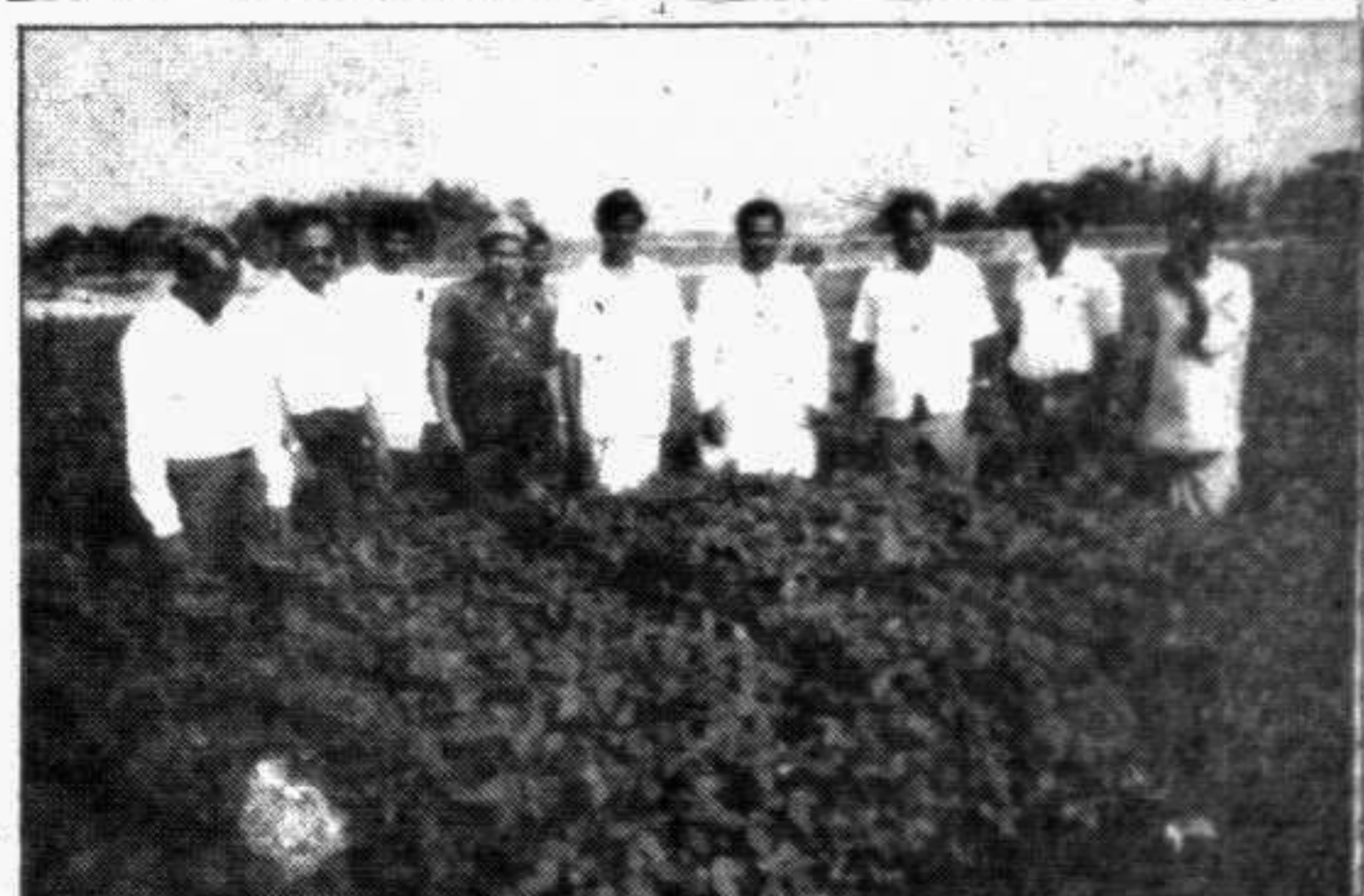
RANGPUR: A demonstration plot of 'Soyabin' at Mukimpur under Pirganj thana of the district.

LALMONIRHAT, Oct 19: The food stock position in the district is said to be satisfactory, reports UNB. According to food officials about 6,380 metric tons of rice, 2827 metric tons of wheat and 8 metric tons of paddy are now in stock in different godowns of the district. The labourers of food for work programme are being given rice instead of wheat as the stock of is more than wheat. There are allegations that the rice raised from some godowns were unfit for consumption. However, the food