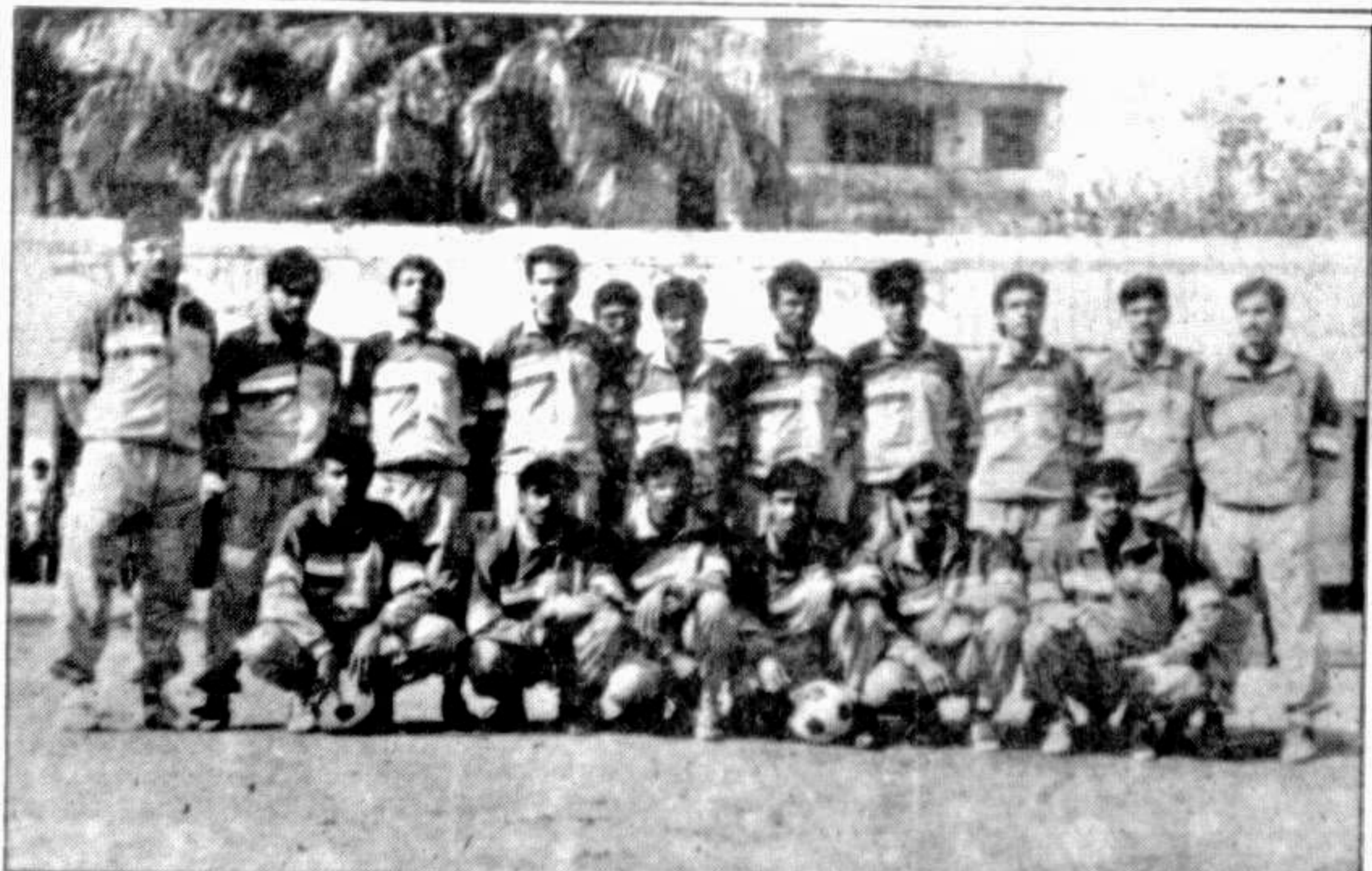
Sonali Bank Second Division football league unbeaten champions Bangladesh Boys Club players pose for photographers at the Hockey Stadium yesterday. Bangladesh Boys ended their triumphant campaign with a 2-0 victory over Shantigan Club.