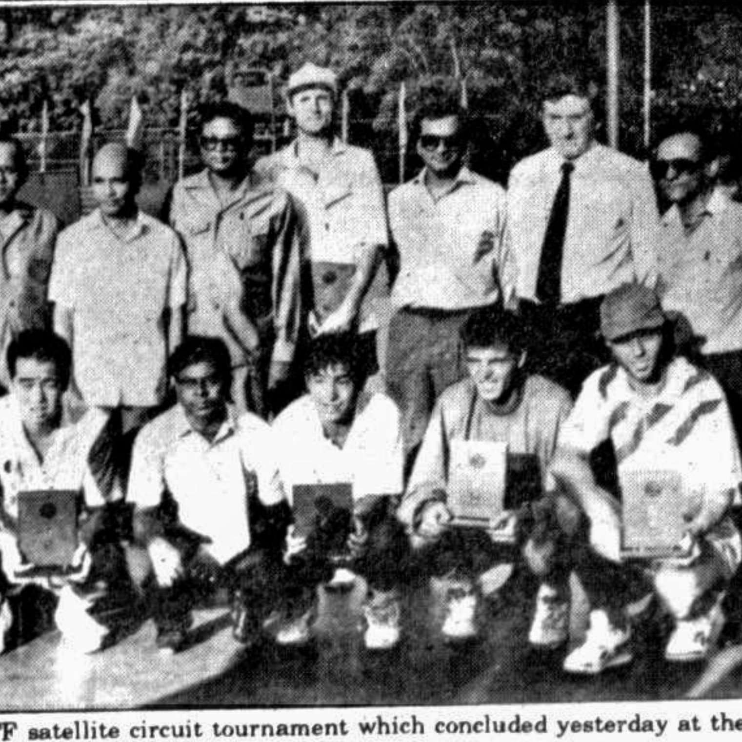
The prize winners of the ITF satellite circuit tournament which concluded yesterday at the National Tennis Complex.

Participating teams have been requested to contact the Badminton Federation by October 24.