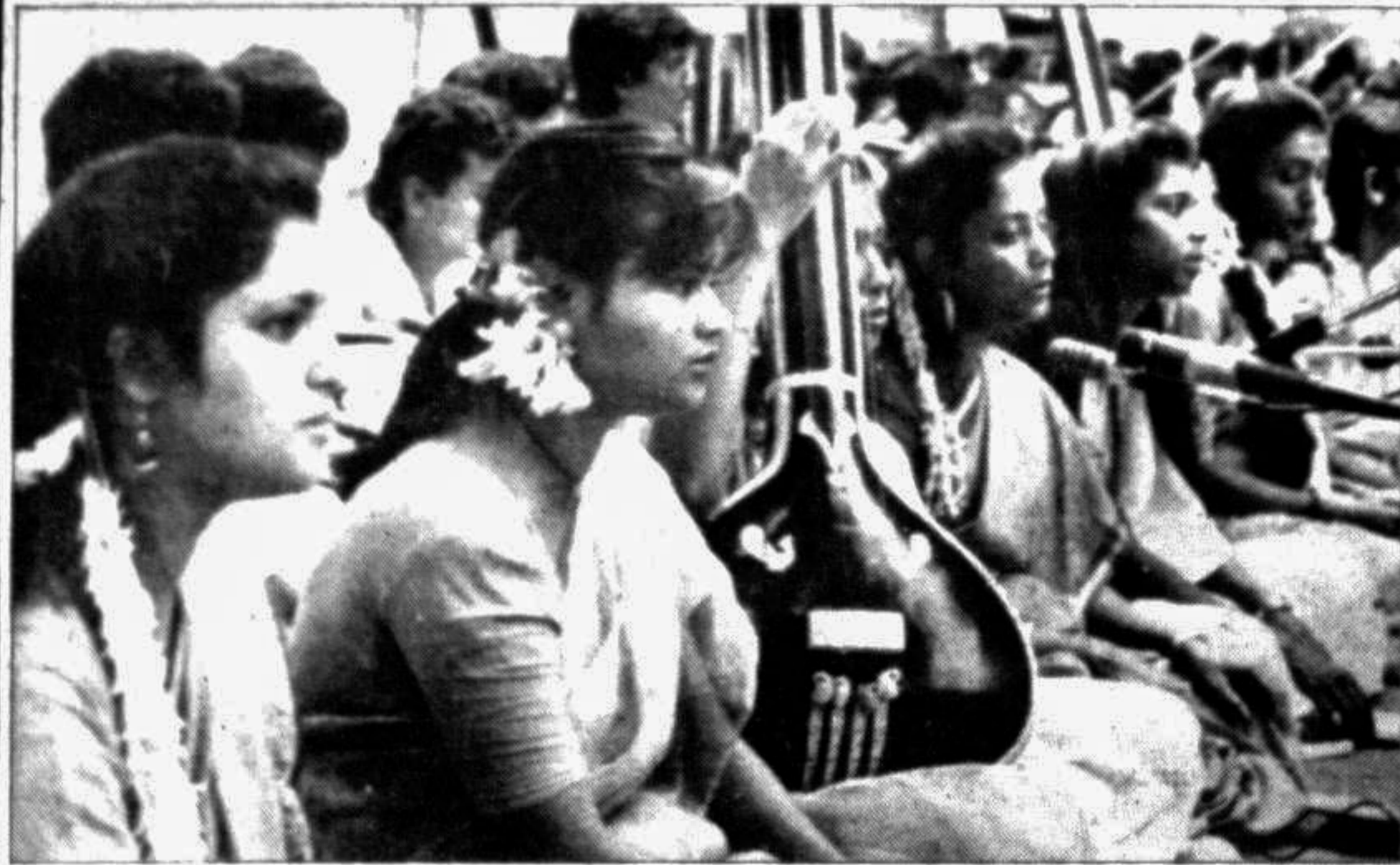
The strains of autumn at Chhayanaut's festival.

Bengalis being sentimental down to their very toenails, they endow each season with a light and mood all its own. If summer is the killer sun and the taste of mango, and the monsoons are the ultimate in romantic encounters, autumn is the season when the sky is softer and the mind relaxed.