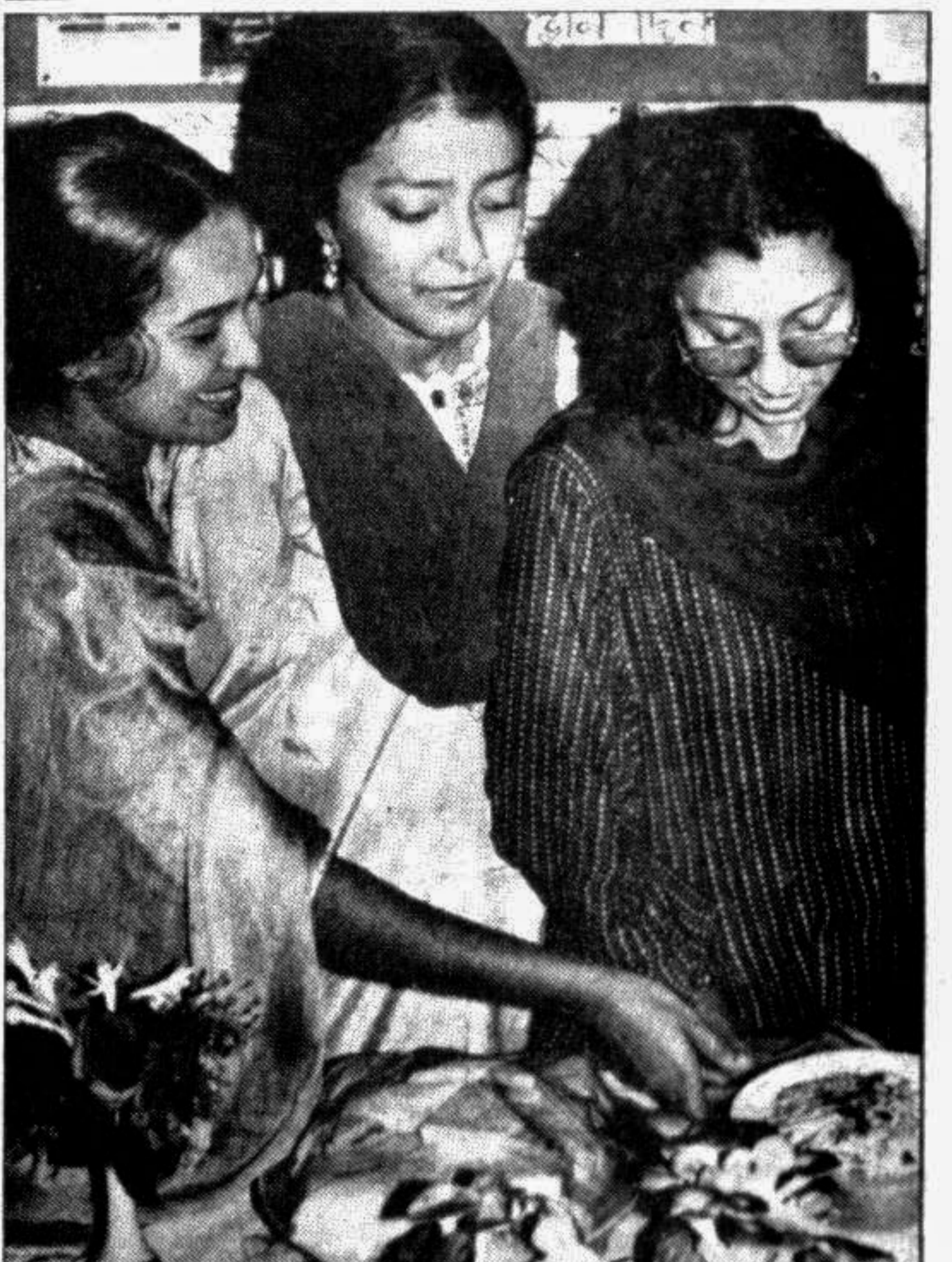
An exhibition of food items was held yesterday at the Institute of Nutrition and Food Sciences in observance of World Food Day.

Lalon Academy also held a discussion meeting at its premises at Sheuria, three miles from here. It was presided over by the DC of Kushtia.