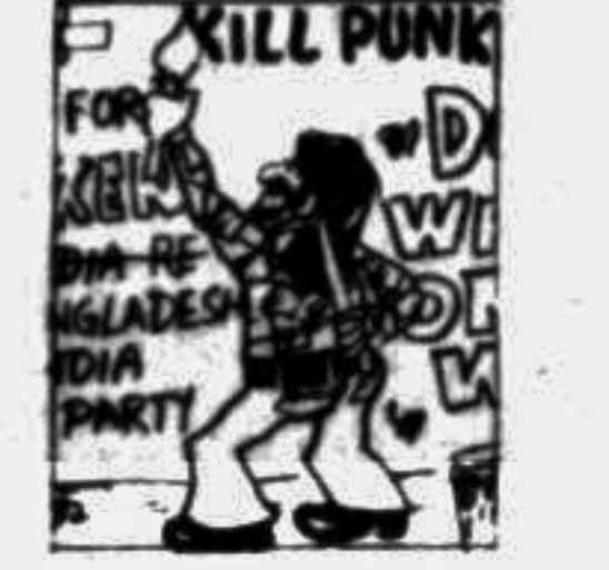
Graffiti and the Dhakaite Page 3