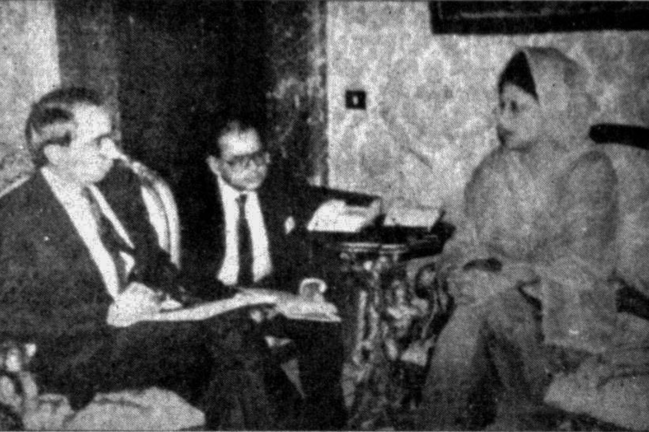
Prime Minister Begum Khaleda Zia holding talks with Italian Prime Minister Giuliano Amato in Rome yesterday.