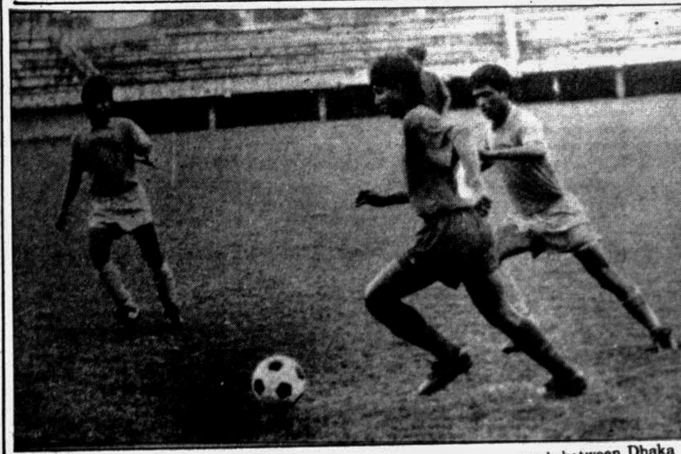
Action from yesterday's Sonali Bank Second Division super league match between Dhaka WASA and Jurain Janata Club at the Hockey Stadium. WASA won 3-1.