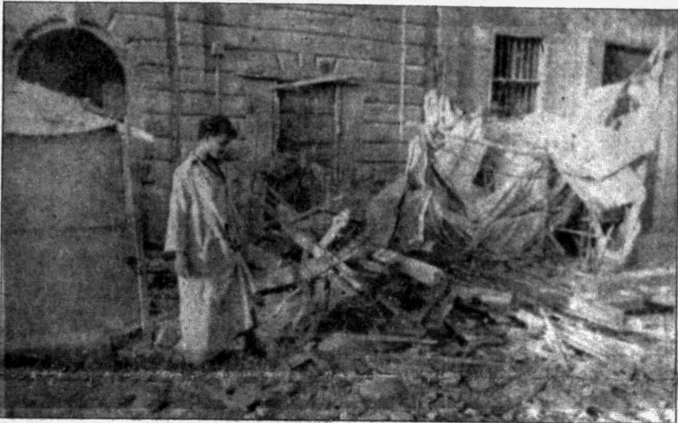
A young boy looks at debris from a house that collapsed after a powerful earthquake, measuring up to 5.8 degrees on the Richter Scale hit Cairo on Monday.