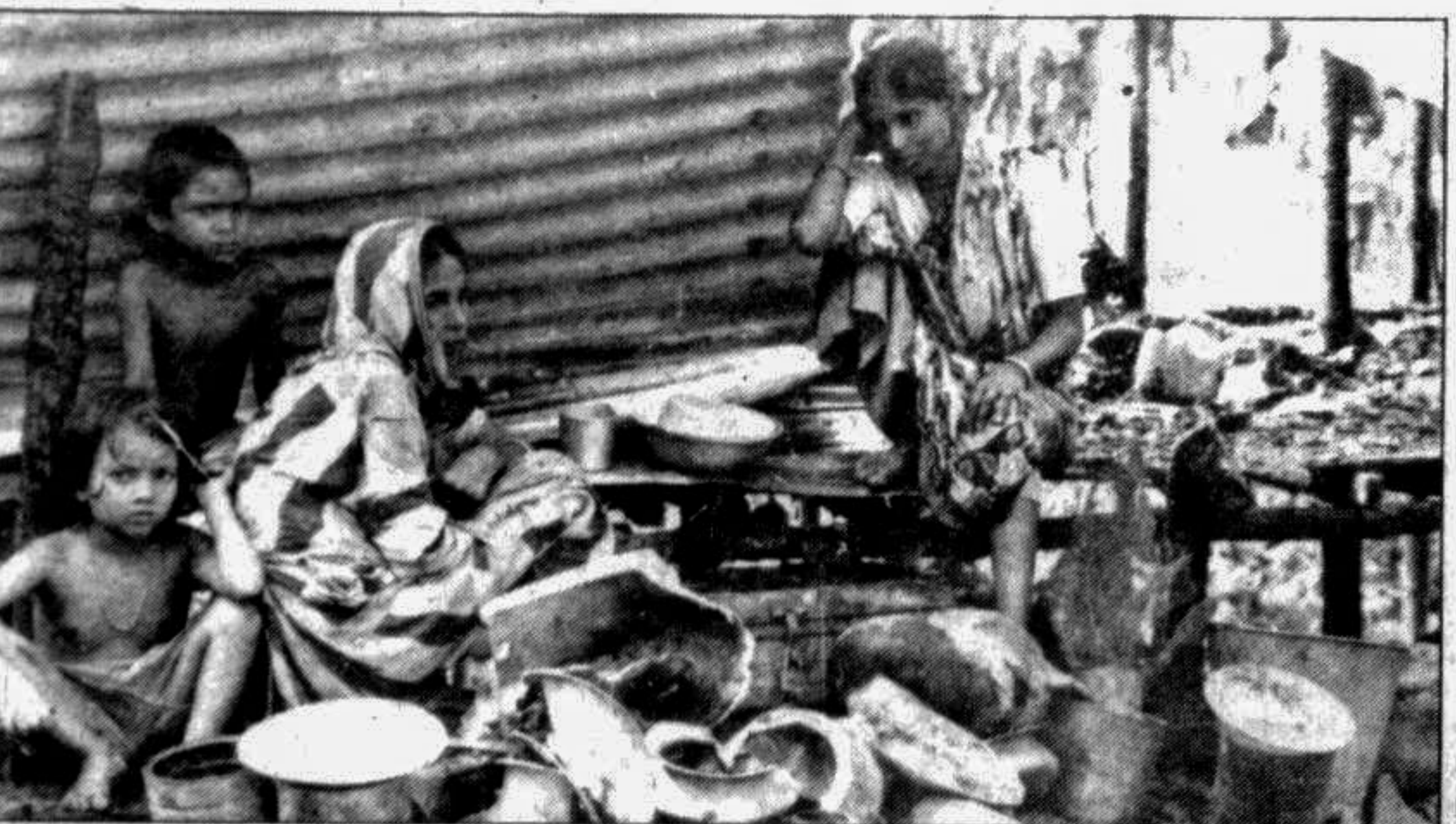
Victims of yesterday's fire at Shaheednagar in city that caused widespread damage to the residents.