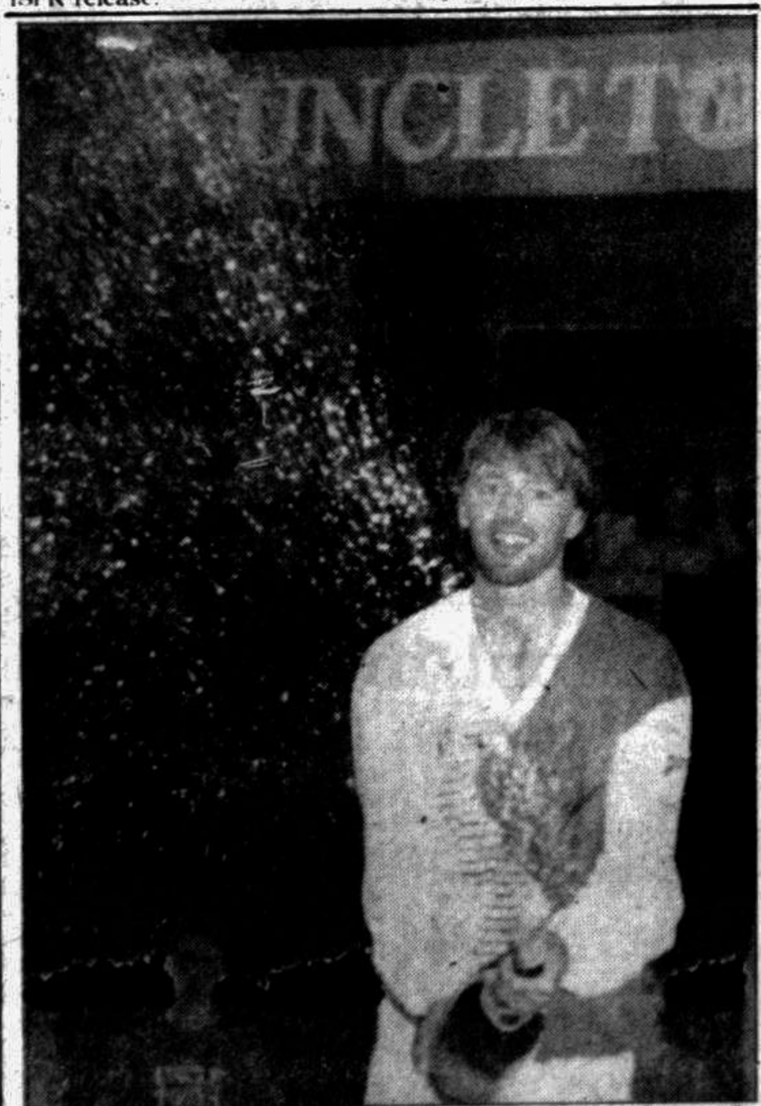
Croatia's Goran Ivanisevic showers the media with champagne after winning the final of the Australian Indoor tennis championships in Sydney on Sunday.