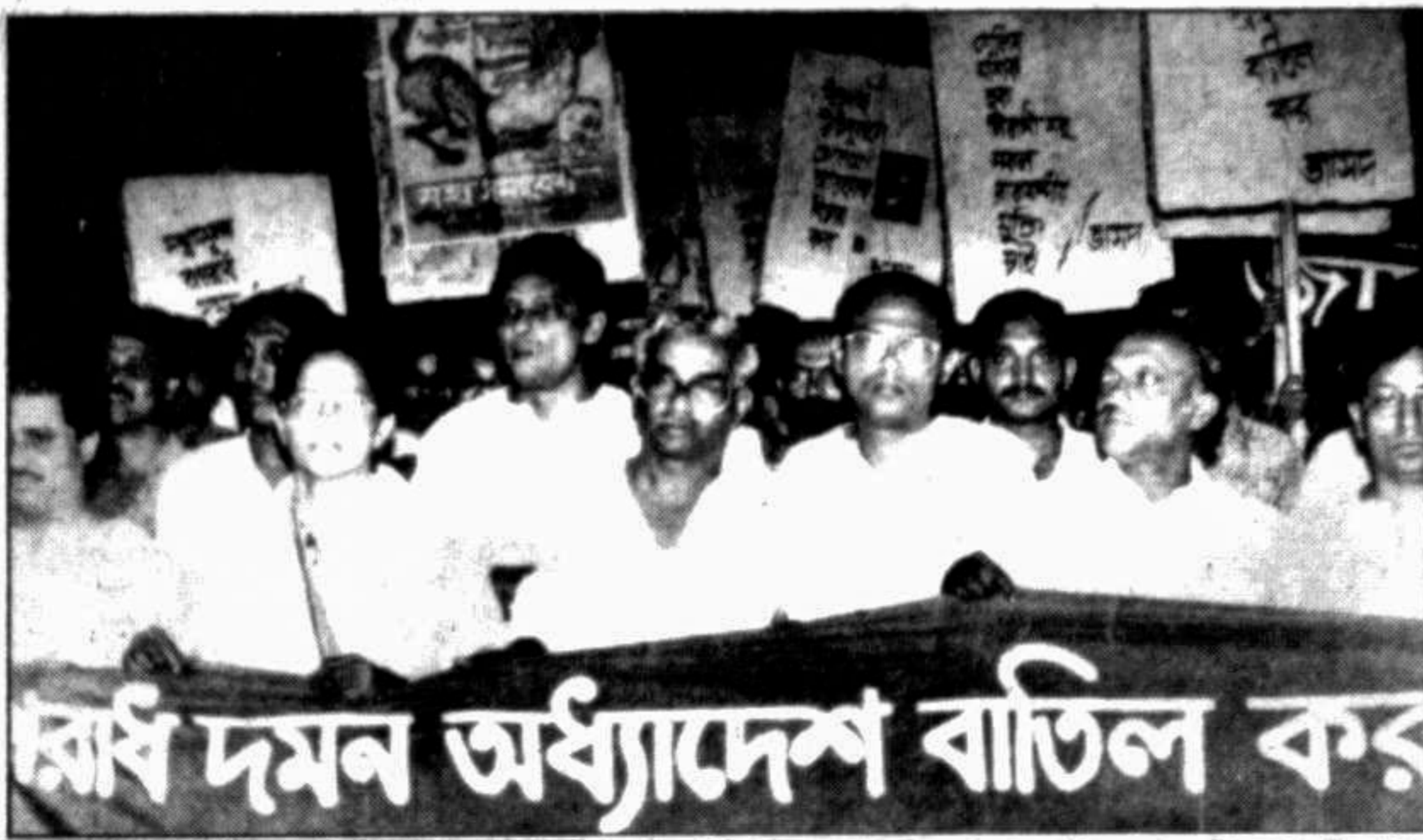
Five-Party Alliance brought out a procession in city yesterday demanding annulment of anti-terrorism ordinance.

nine militants were among 10 people killed and three militants were nabbed in Punjab since last night. Two unidentified militants were killed in an encounter with securitymen near Jarhtoli village in Jagraon police district while another militant, identified as Gurbhuj Singh alias Bheja, was killed near Maqbool Pur village in Amritsar district last night. One special and one 30 bore pistols, 12 live and seven empty cartridges were seized from the sites of encounter. In another encounter, an unidentified militant was killed in sadar police station area of Amritsar last night. Two others, one of them identified as Jaswinder Singh Sahid, were killed in another encounter near Bhal Ladhu village in Tarn Taran police district. One SLR, one magazine, one 12 bore DBBL gun, one LMG magazine of AK-47 and over two hundred cartridges of different calibres were seized from the scene.