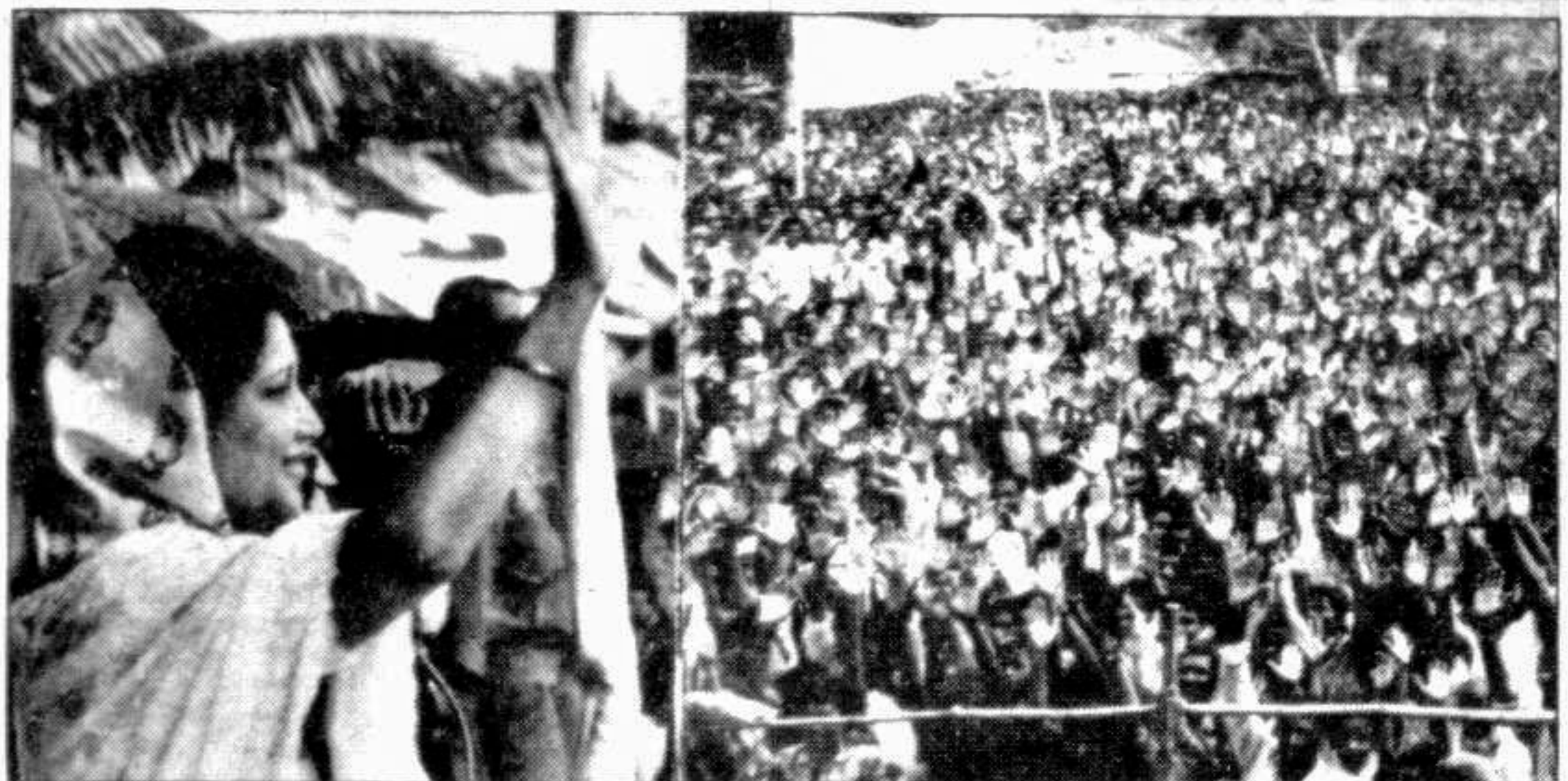
Prime Minister Begum Khaleda Zia addressing a public meeting at Shambhuganj in Mymensingh yesterday.

The Opposition, spear-headed by Suranjit Sengupta See Page 12 Col 7