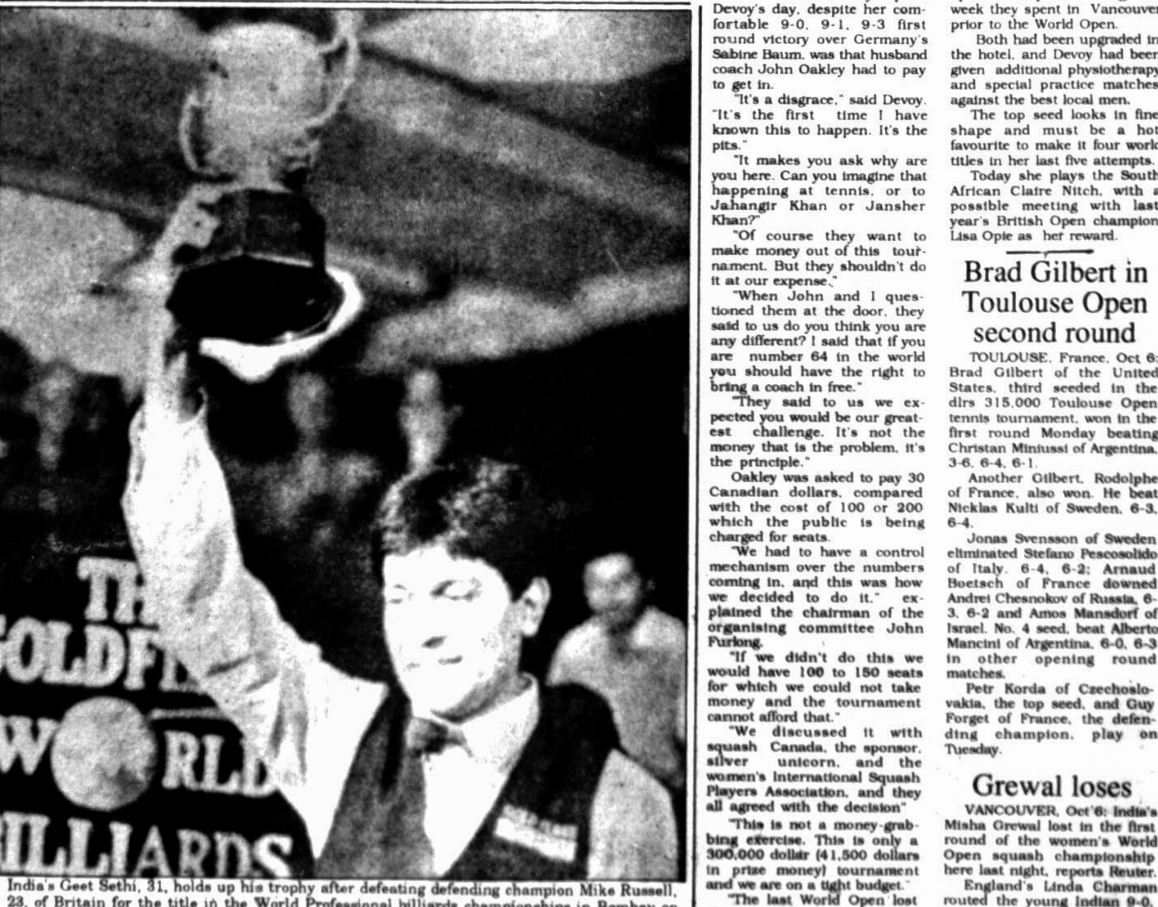
India's Geet Sethi, 31, holds up his trophy after defeating defending champion Mike Russell, 23, of Britain for the title in the World Professional billiards championships in Bombay on Sunday.