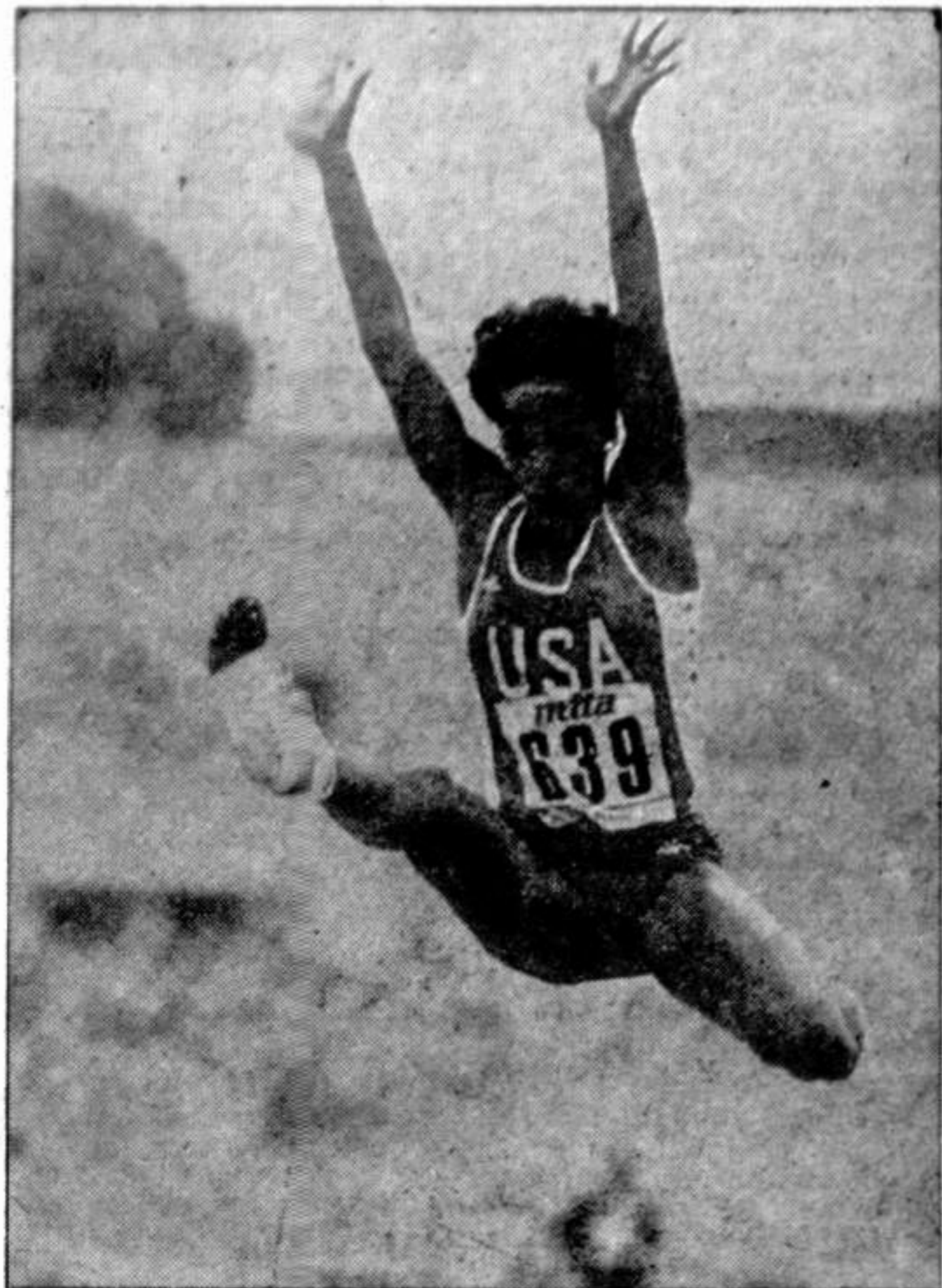
JOYNER-KERSEE Third-time winner