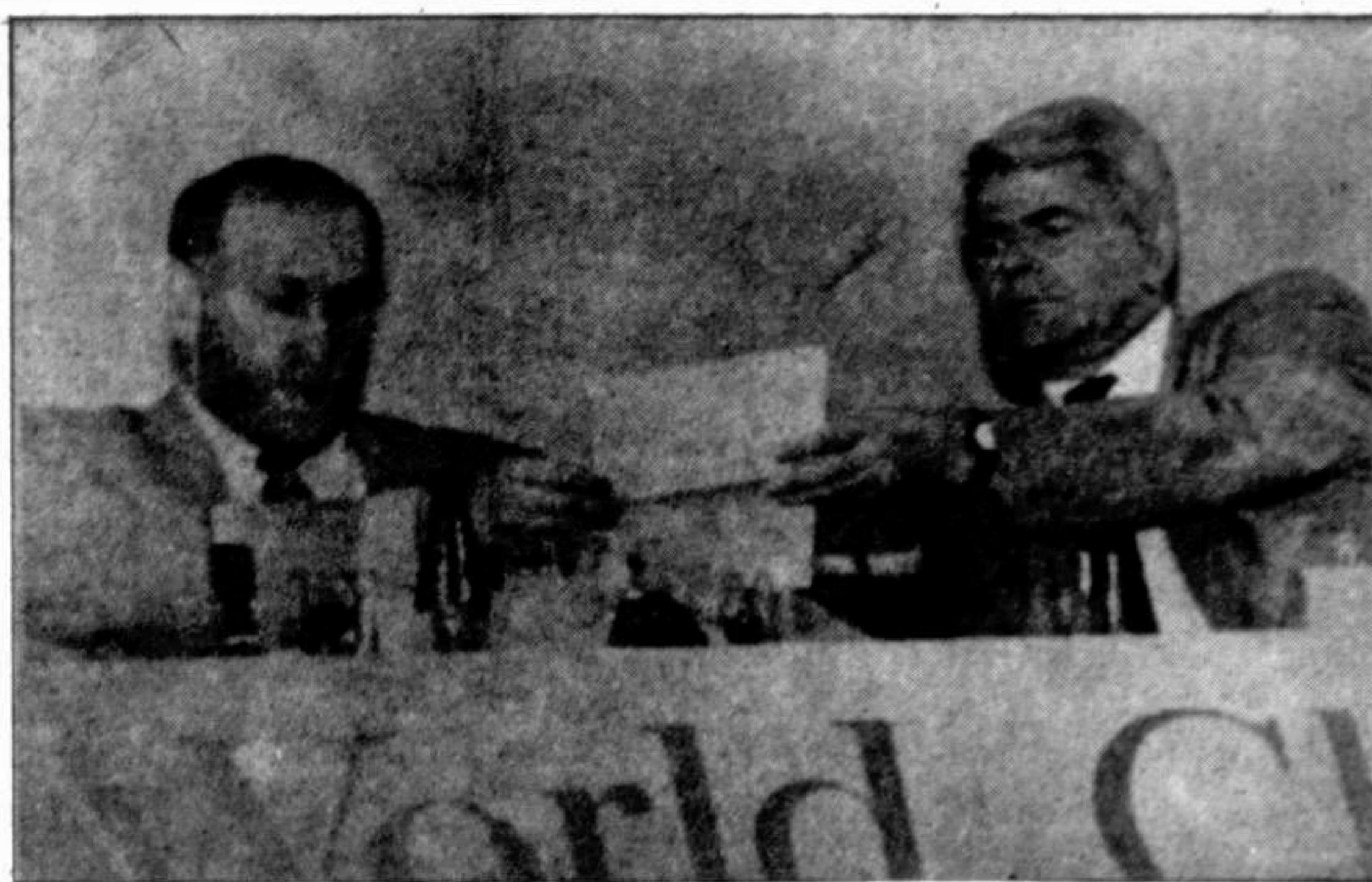
Boris Spassky (R) passes a sheet of paper with journalists' questions to his rival Bobby Fischer during a press conference after their "World Championship" game in Belgrade on Monday. Fischer leads the series five games to three.