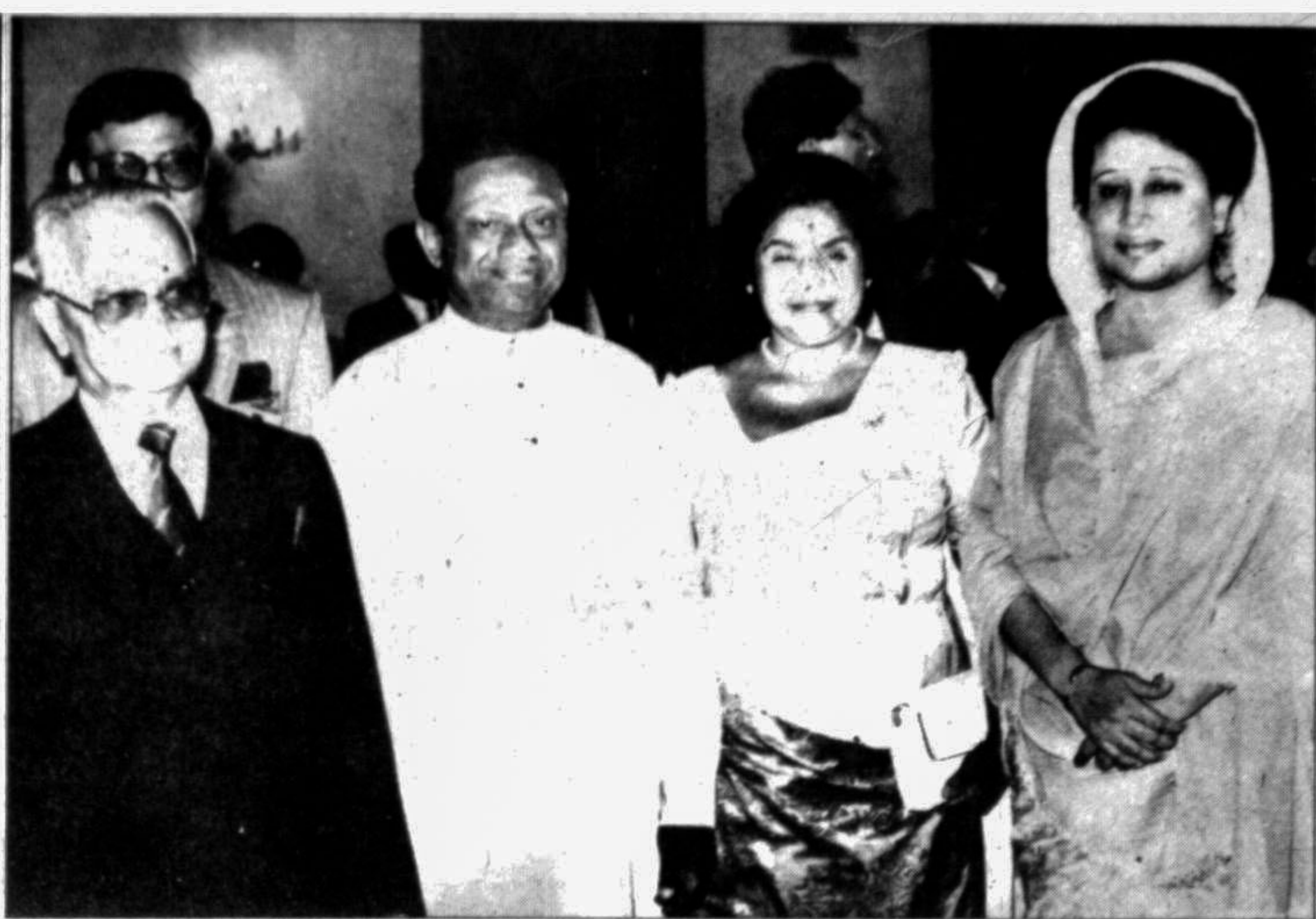
Flanked by President Abdur Rahman Biswas and Prime Minister Begum Khaleda Zia President and Madam Ranasinghe Premadasa at the formal reception at the Bangabhaban yesterday.

President Premadasa recalled that at the Colombo summit the leaders had reaffirmed full respect for the principle of sovereign equality, independence and territorial integrity of all states. We have agreed to adhere to the principles of the non-use of force, the peaceful settlement of disputes and non interference in each other's internal affairs, he said.