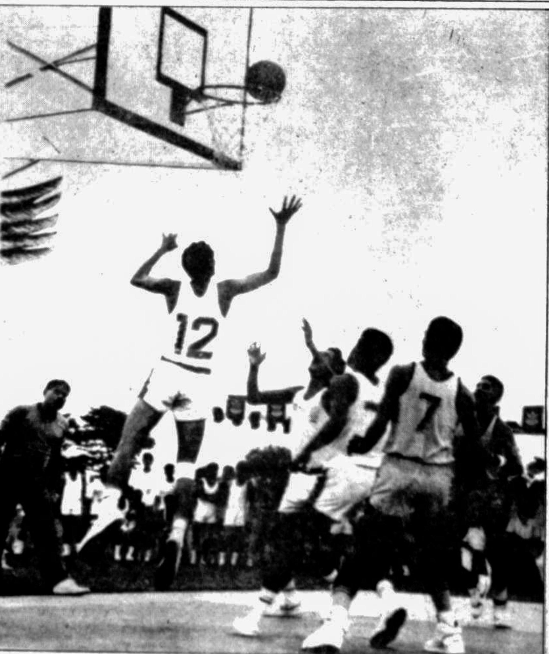
Action from yesterday's inter-services basketball championship match between Bangladesh Navy and Bangladesh Air Force at the BAF Sports Complex.