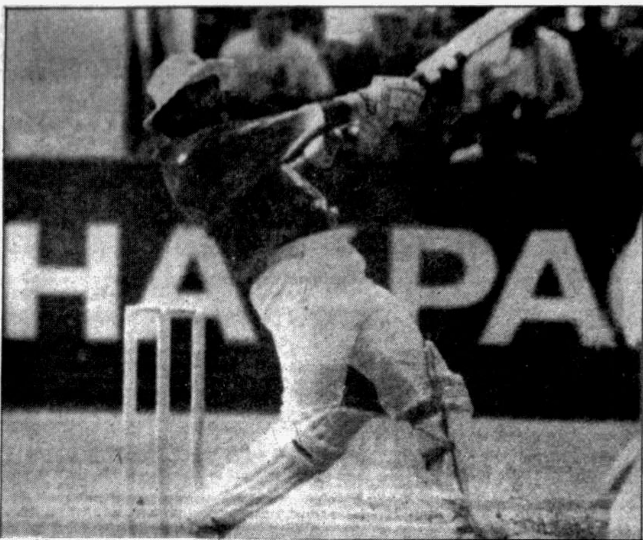
Pakistan's captain Javed Miandad is caught out for 13 by Australia's James Pyke at the inaugural Hong Kong international cricket World Sixes yesterday. Pakistan finished on 77 for 3 to beat Australia, who finished 59 for 5.