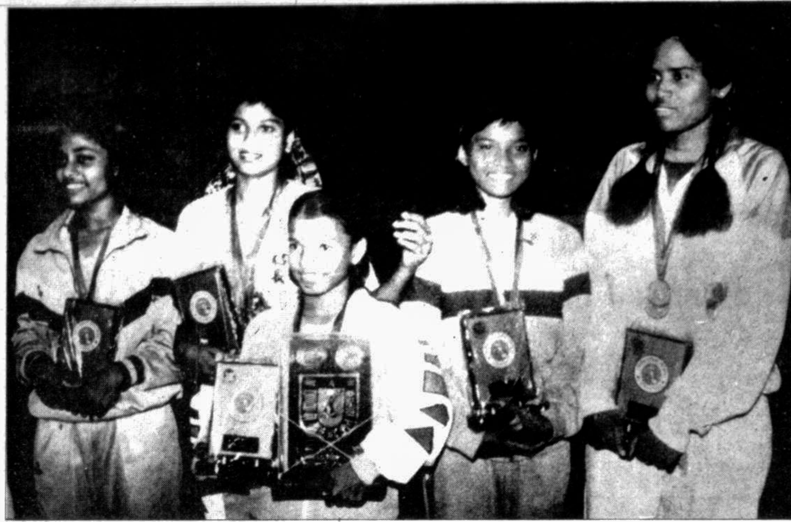
Some of the proud gold medalists of the four-day national women's swimming championships which concluded at the Dhanmandi Women's Complex pool yesterday.