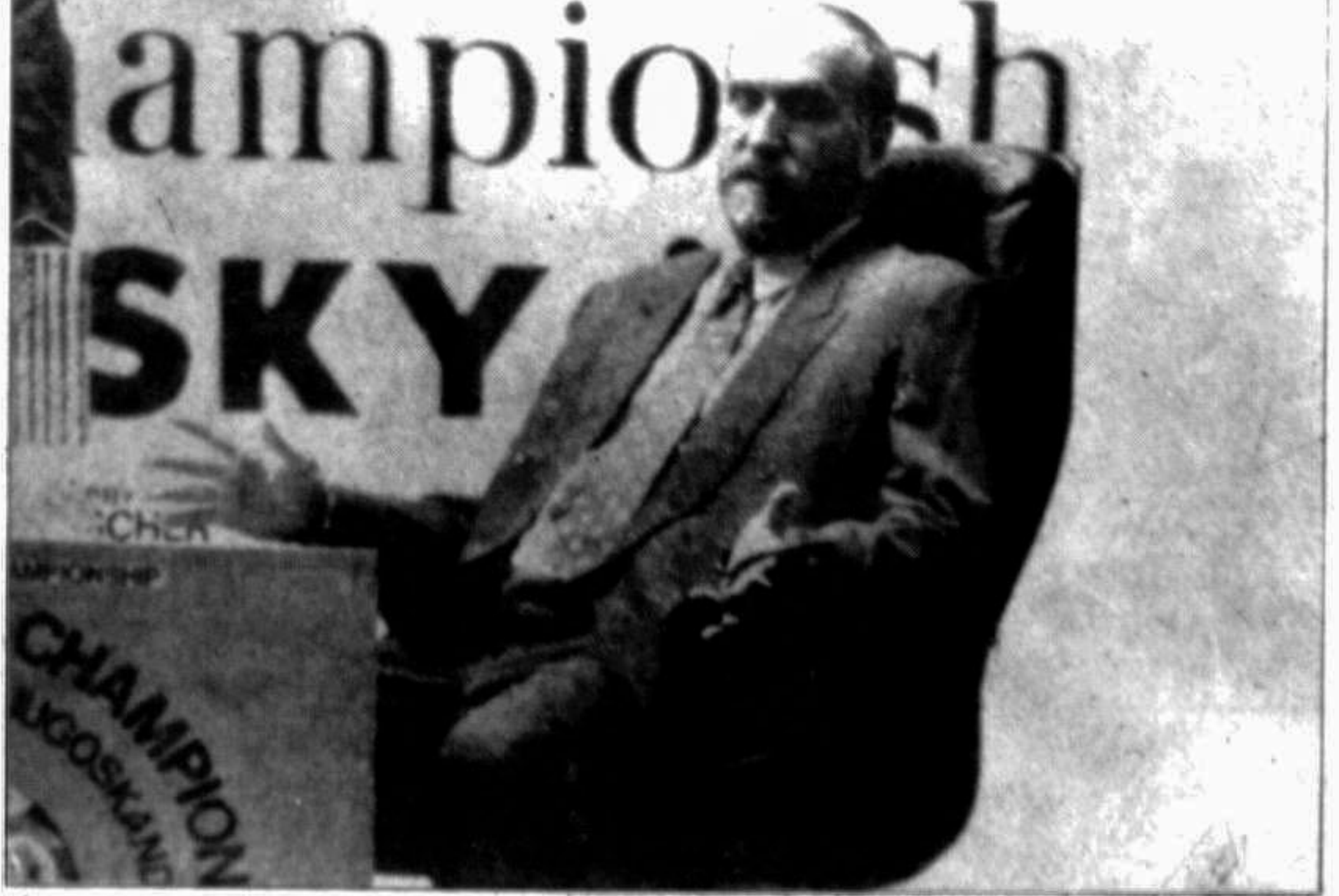
American chess Grandmaster Bobby Fischer asks officials to have journalists removed at the start of the 13th game with Boris Spassky in Belgrade on Thursday. Spassky won the 12th game.

BELGRADE, Oct 2: Former world chess champions Bobby Fischer and Boris Spassky used a Sicilian defence on Thursday to start the 13th game in their controversial 5 million dollar chess series in Belgrade, reports Reuter. Fischer, 40, started with a 5-3 lead over Spassky from a series which began earlier this month at Sveti Stefan, an island resort off the Adriatic coast of the small Yugoslav state of Montenegro. Fischer lost the opening game of the second leg, which began in Belgrade on Wednesday. The two resumed their match in a big Belgrade theatre sealed off behind a glass screen from several hundred onlookers seated in the auditorium. The first player to score 10 points, draws not being counted, will win 3.5 million dollars and the loser is entitled to 1.5 million dollar.