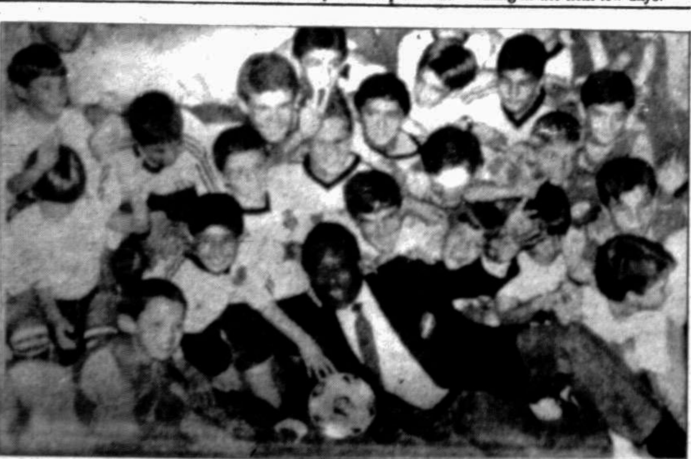
Brazilian soccer star Pele poses with children at a football school in Istanbul on Thursday. The former soccer player is in Turkey on a promotion tour.

LONDON, Oct 2: Lazio's Paul Gascoigne is back in the England squad for their World Cup qualifying match against Norway at Wembley on October 14, reports AFP. The midfielder, who played his first competitive match in the Italian League last weekend after an 18-month layoff because of a serious knee injury, was included in the 22-man squad picked by Graham Taylor. Gascoigne is one of three Serie A players on the side, along with Juventus' David Platt and Sampdoria's Des Walker.