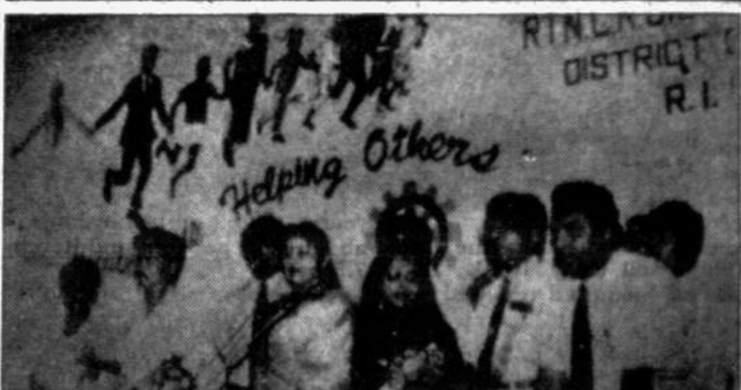
CHANDPUR: Artists are rendering songs at a cultural function organised on the occasion of 3rd installation ceremony of local Central Rotary Club recently.

A large number of blacksmiths in Sadar, Kalaroa, Tala, Debhata, Kaliganj, Shyamnagar and Assasuni thanas of the district have already given up their profession.