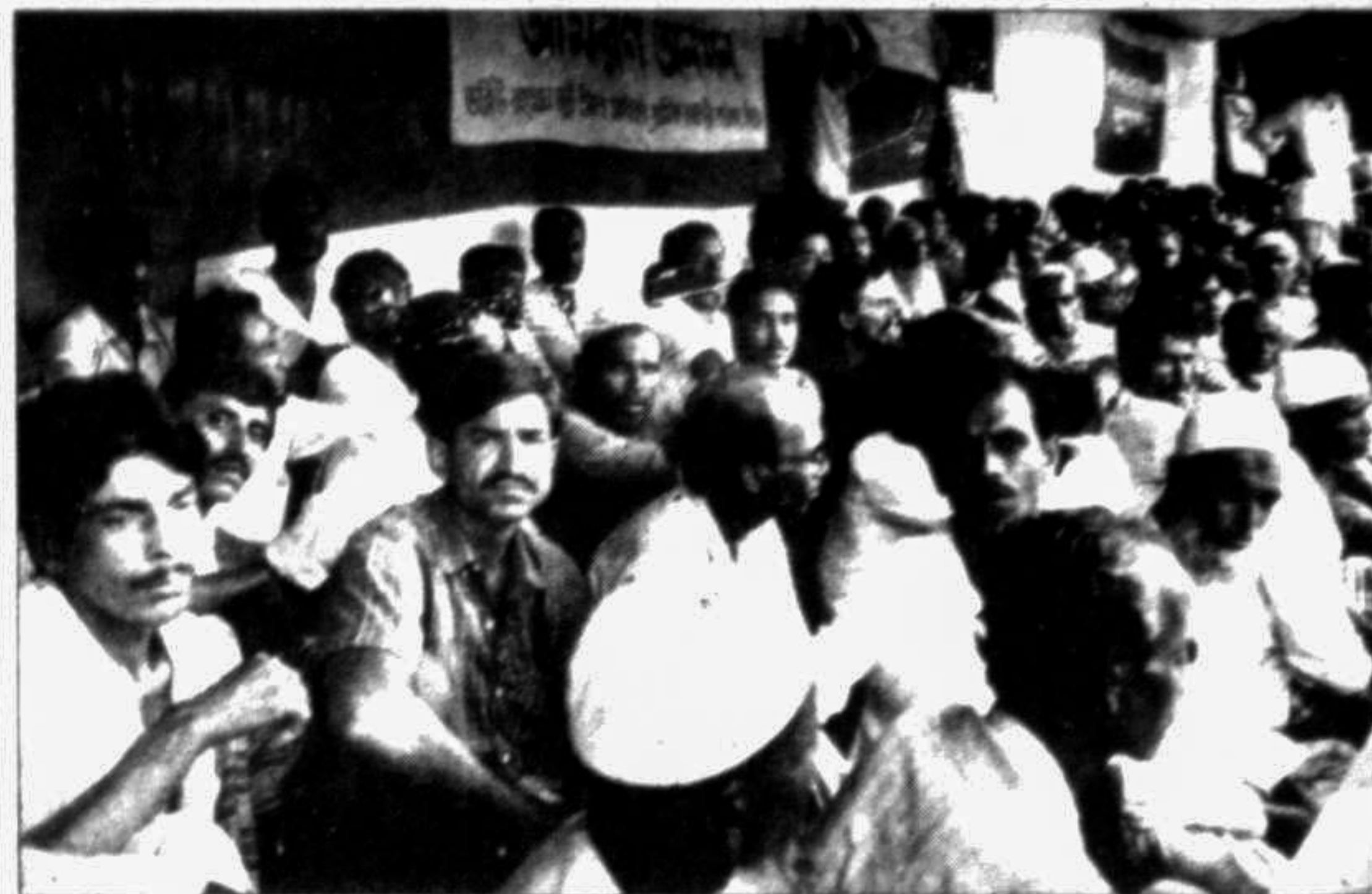
Workers of W Rahman Jute Mills on hunger strike in front of National Press Club yesterday, demanding reopening of the mill.

Bangladesh is a signatory to the UN charter of children's rights through which it is pledge-bound to ensure and protect rights of the children, she said.