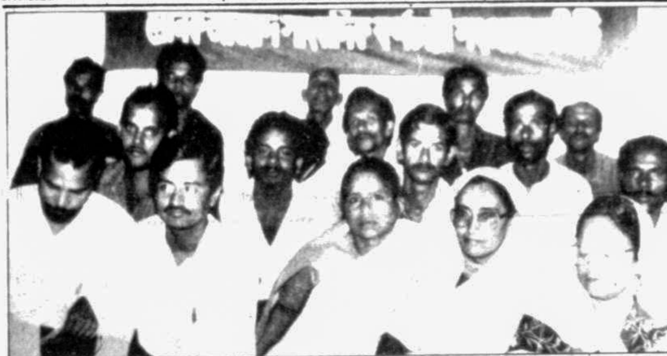
The Daily Azad journalists, employees staged token hunger strike at National Press Club yesterday demanding payments of arrear salaries.