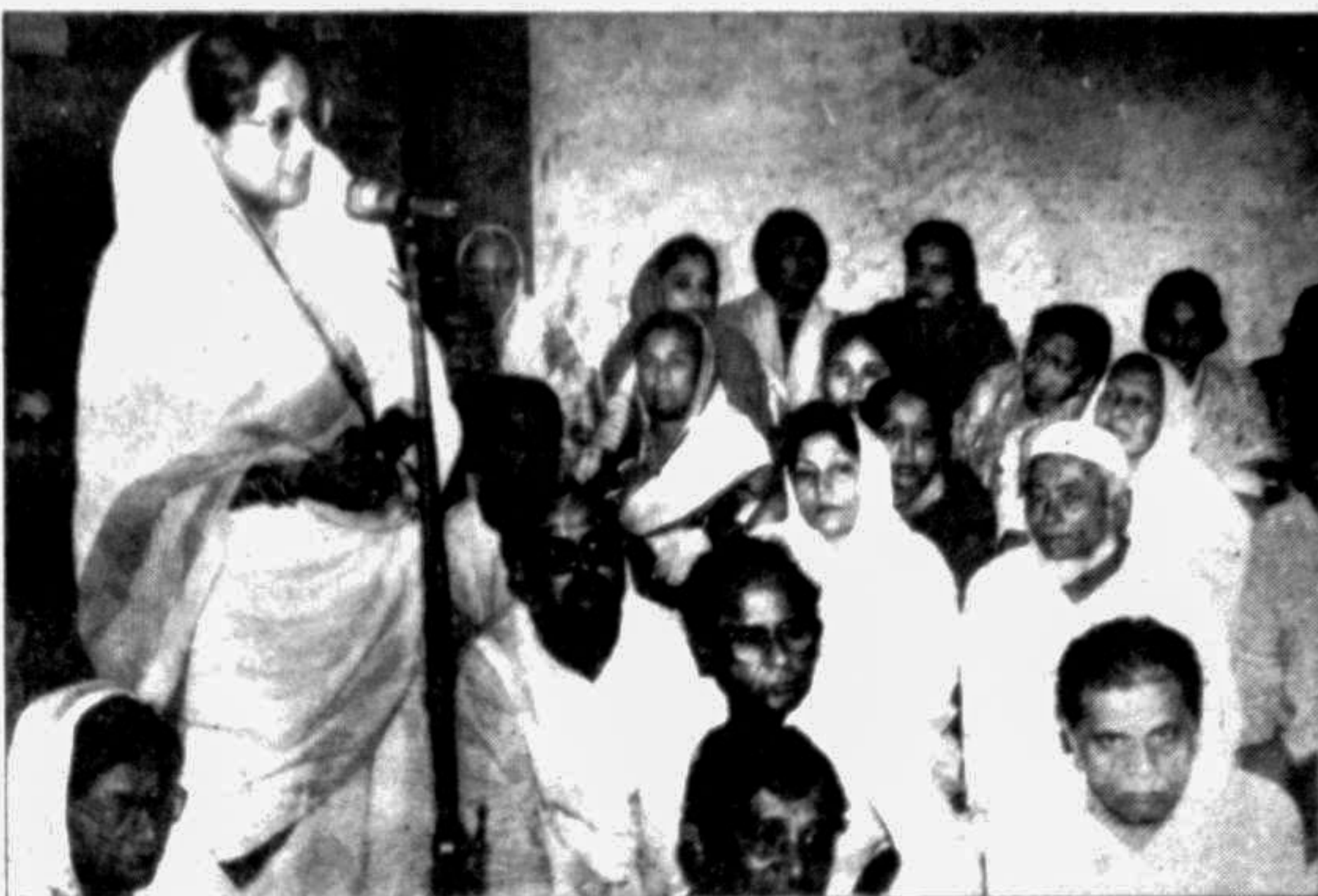
Sheikh Hasina addressing a meeting arranged by Dhaka City unit of Awami League to mark the death anniversary of Moyezuddin Ahmed at the party central office in city yesterday.

Published by the Editor on behalf of Mediaword Ltd, 52 Motiheel C/A, Dhaka-1000 and printed by him at The Sangbad Ltd, 36 Purana Paltan, Dhaka. Editorial, News & Commercial Offices: 28/1, Toynebe Circular Road, Dhaka-1000. Tel: PABX- 246023-4, 245061-2. Advertisement: 245063 & Ext. 20, Fax No. 88-02 863035. GPO Box No. 3257. GRAM: DAILY STAR DHAKA.