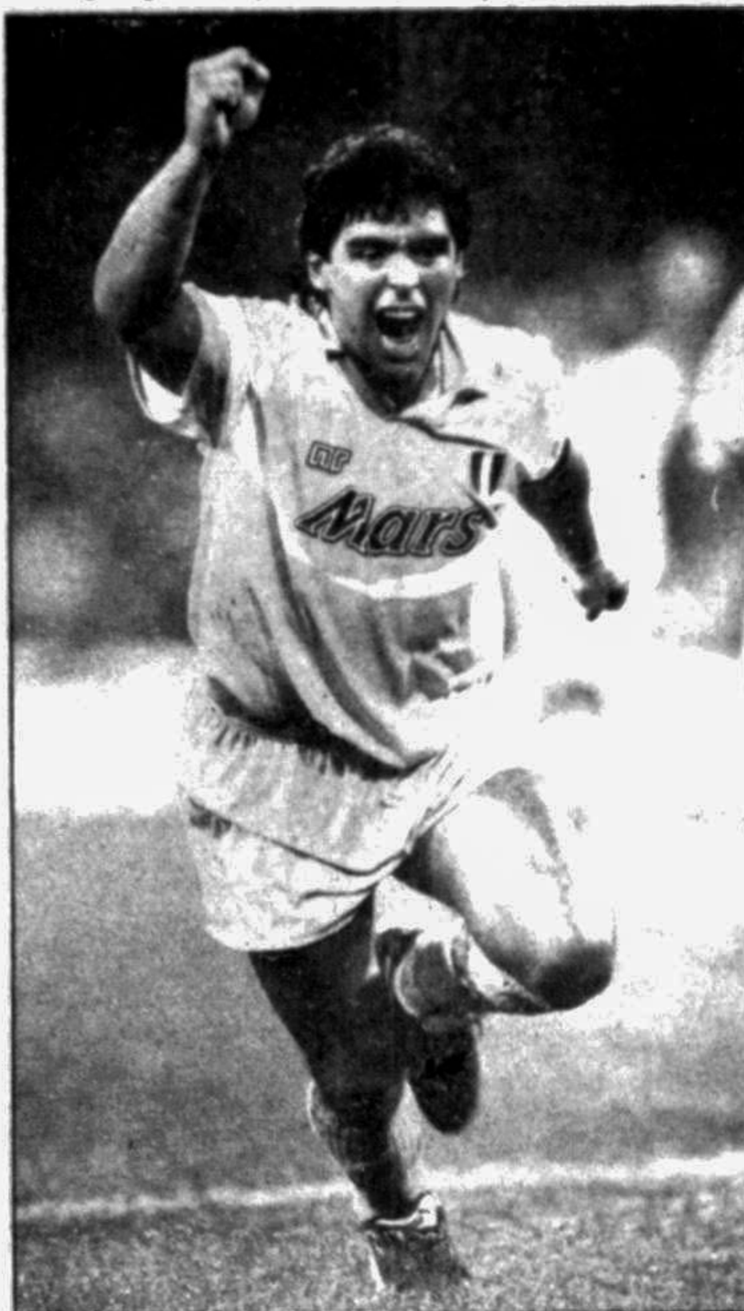
MARADONA ... back in action European Cup winner, and Real Madrid. But his presence cheered his new team to a 3-0 home victory over Logrones, at