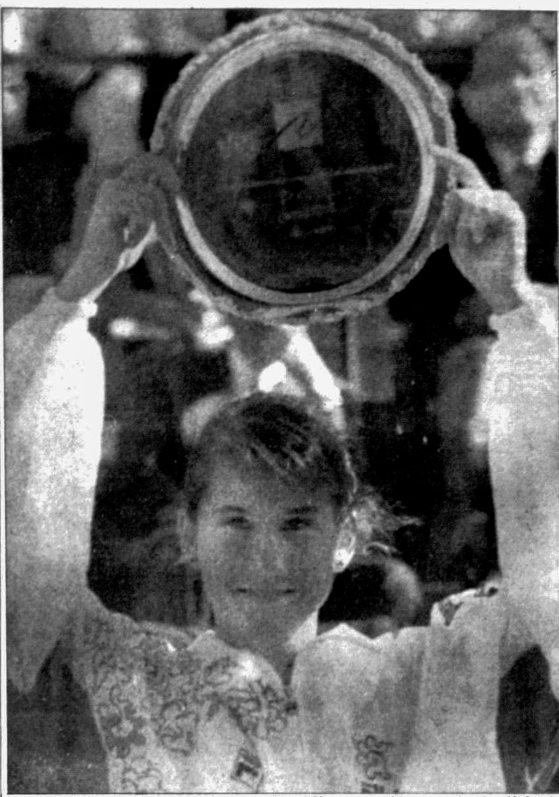
Monica Seles of Yugoslavia, who won three Grand Slam events this year, raises her Nichirei trophy after winning the final against Argentina Gabriela Sabatini in Tokyo on Sunday. She won 6-2, 6-0.