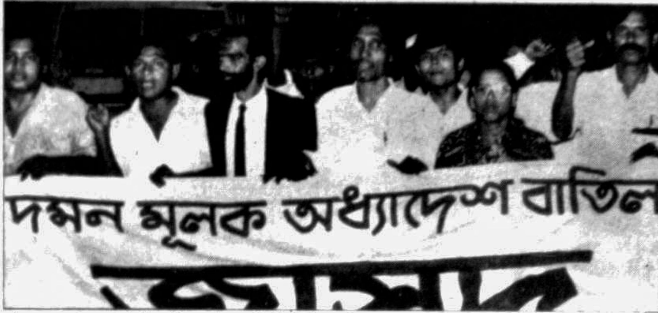
A procession of Jatiya Samajtantrik Dal (Inu) demanding the withdrawal of anti-terrorism bill in the city yesterday.