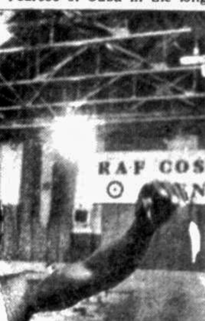
JUMP AT 26 FEET, 1 3/4 INCHES (7.97 METRES).

Other men's winners were Olympic bronze medalist Addis Adebbe of Ethiopia in the 10,000 in 28:44.38 and Ivan Pedroso of Cuba in the long