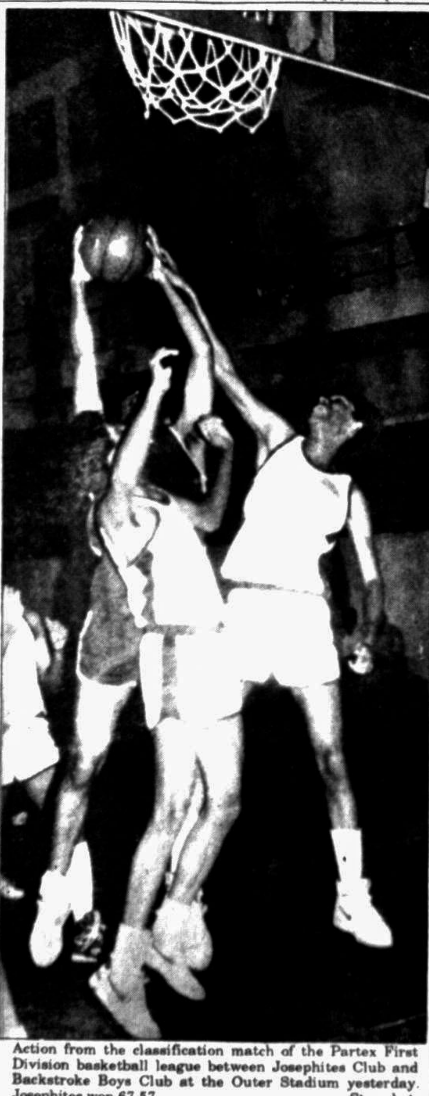
Action from the classification match of the Partex First Division Basketball league between Josephites Club and Backstroke Boys Club at the Outer Stadium yesterday. Josephites won 67-57.

Besides his love for the game, fans speculated he may have showed up as a diplomatic gesture to former foe South Korea, which he will visit in November. If the latter, Yeltsin's cause was hardly helped when, at the beginning of the match, technicians accidentally played the national anthem of Communist North Korea in honour of the team from South Korea.