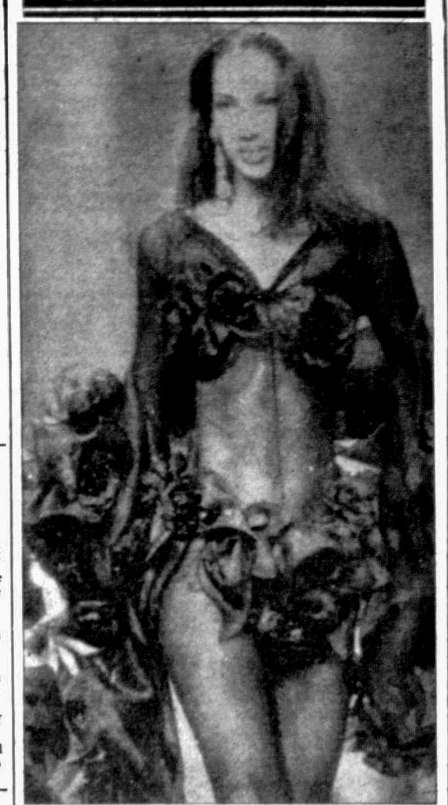
A model parades down the catwalk wearing a spectacular black gauze evening dress designed by Sevillle designer Vittorio and Lucchino, during 'Pesarela Cibeles' spring and summer '93 collections in Madrid on Thursday.