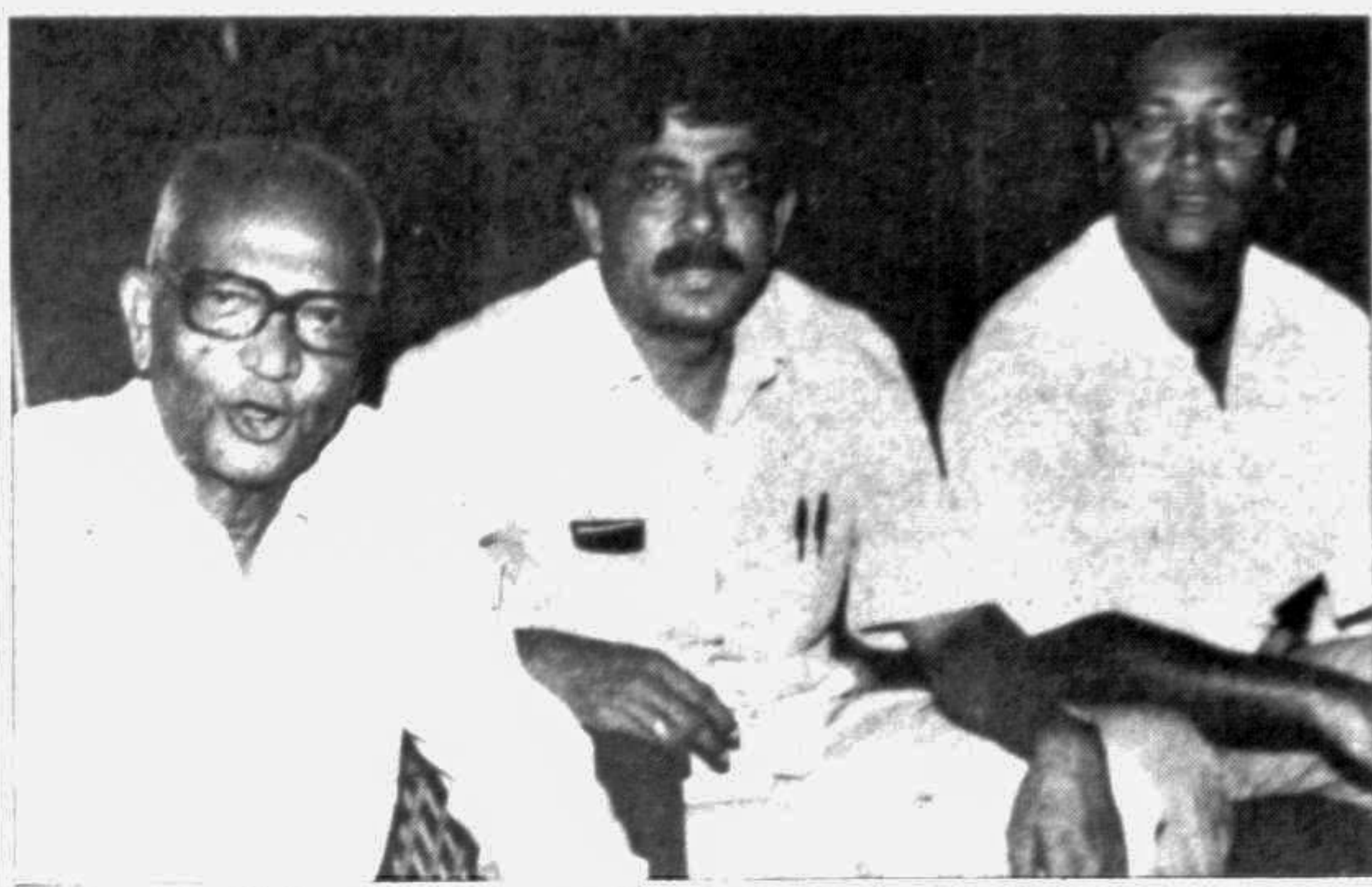
Railway Sramik Karmachari Sangram Parishad held a press conference at the National Press Club yesterday.