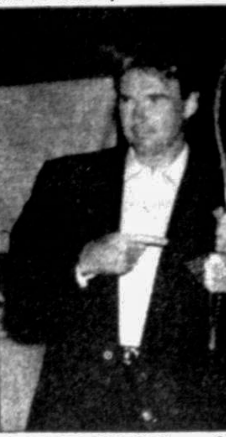
FRIENDS OR FOES... Jimmy Connors and Martina Navratilova are seen sharing a joke.

favourite to win the latest mixed-gender battle in a match he believes will even the score for Riggs' loss to King two decades ago. "I've been waiting 20 years to get even," Connors said. "It's been playing on my mind for 20 years. I want to set it straight."