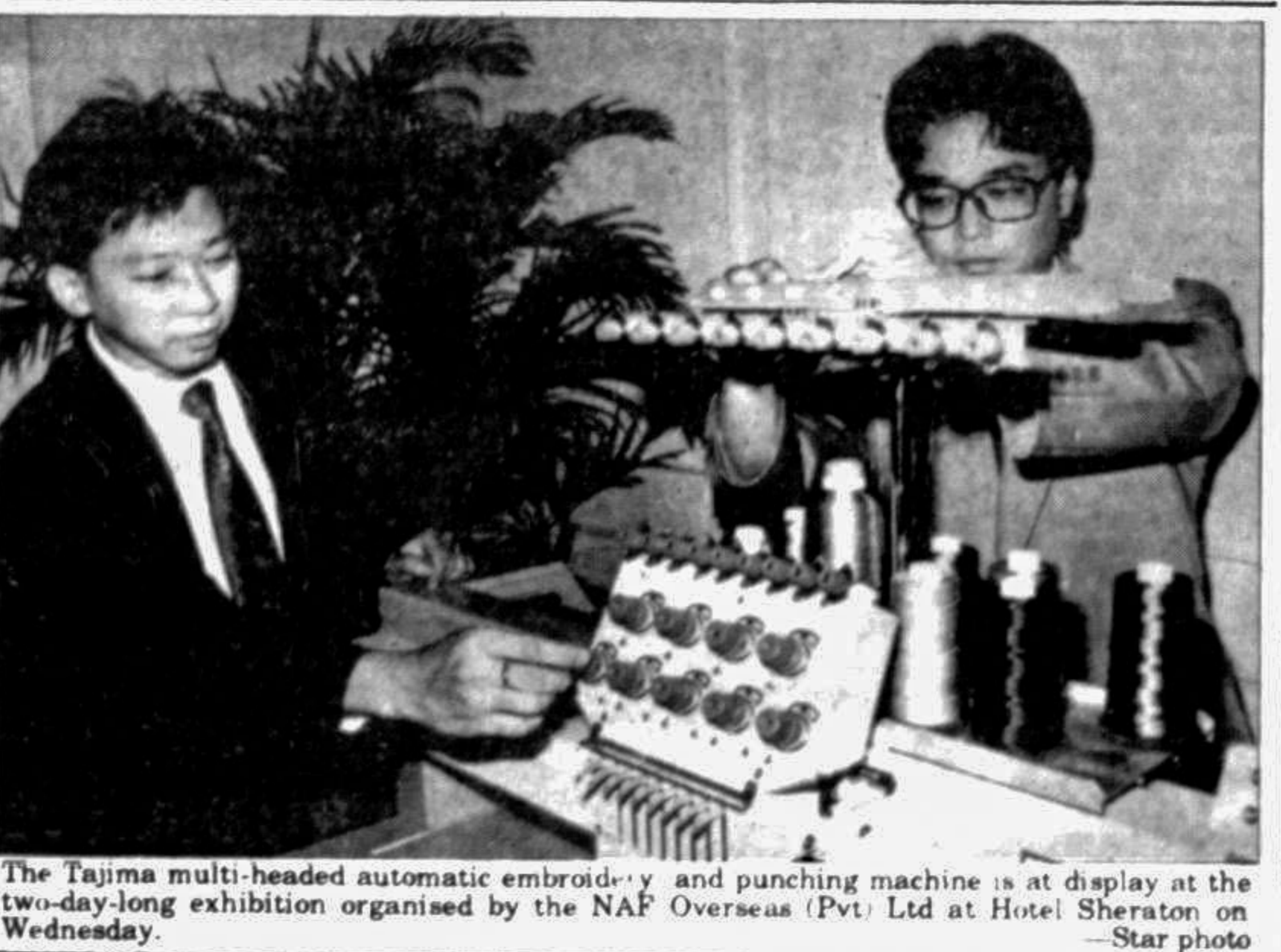
The Tajima multi-headed automatic embroidery and punching machine is at display at the two-day-long exhibition organised by the NAF Overseas (Pvt) Ltd at Hotel Sheraton on Wednesday.

The next auction will be held in Chittagong on September 29 and offerings will comprise of about 22,000 packages of leaf and 6,500 packages of dust.