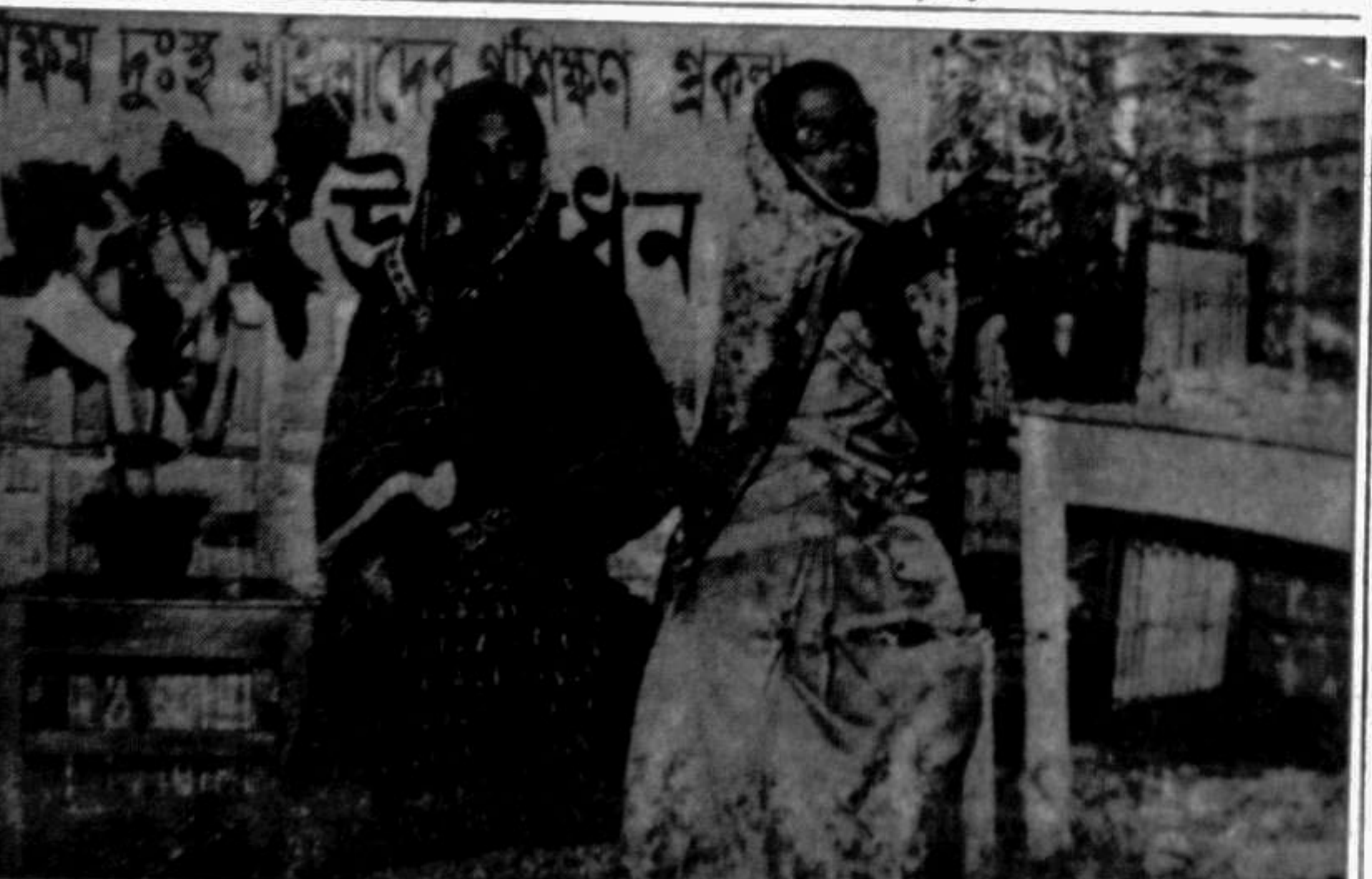
RANGPUR: The distressed women are taking training on handicrafts. The training is conducted by a local social welfare organisations.