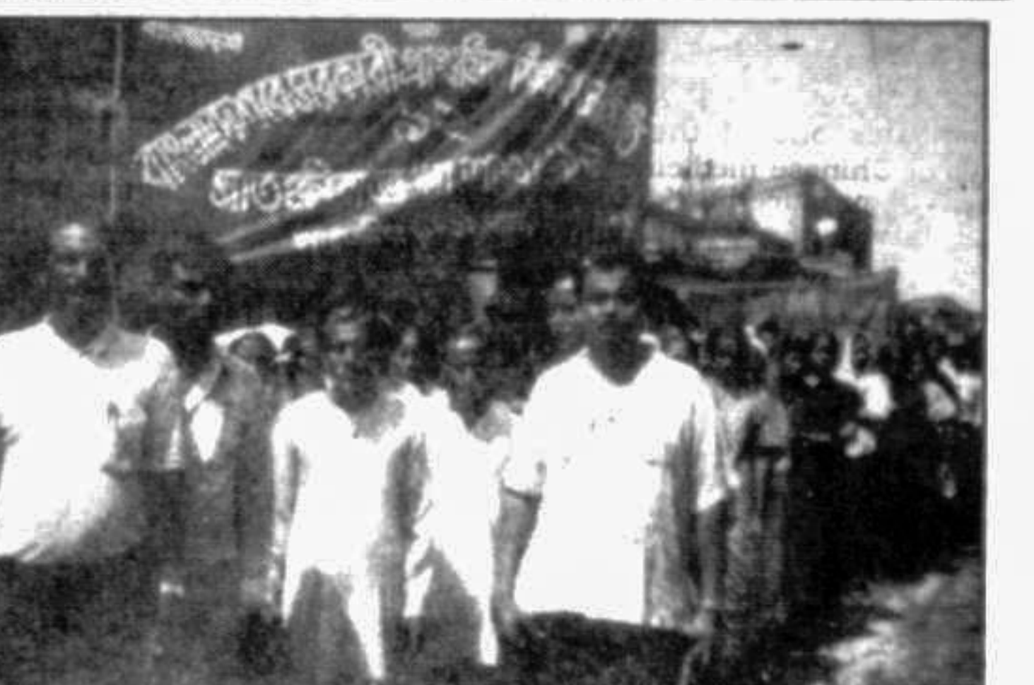
SATKHIRA: The teachers of the local non-government schools recently brought out a procession in support of their 5-point demands.

The BDR jawans of 15th Battalion raided the house at Refugee Colony Para Friday and seized contraband items including 600 pieces of Indian sarees, 250 blouse pieces and 20 bundle of cotton cloth.