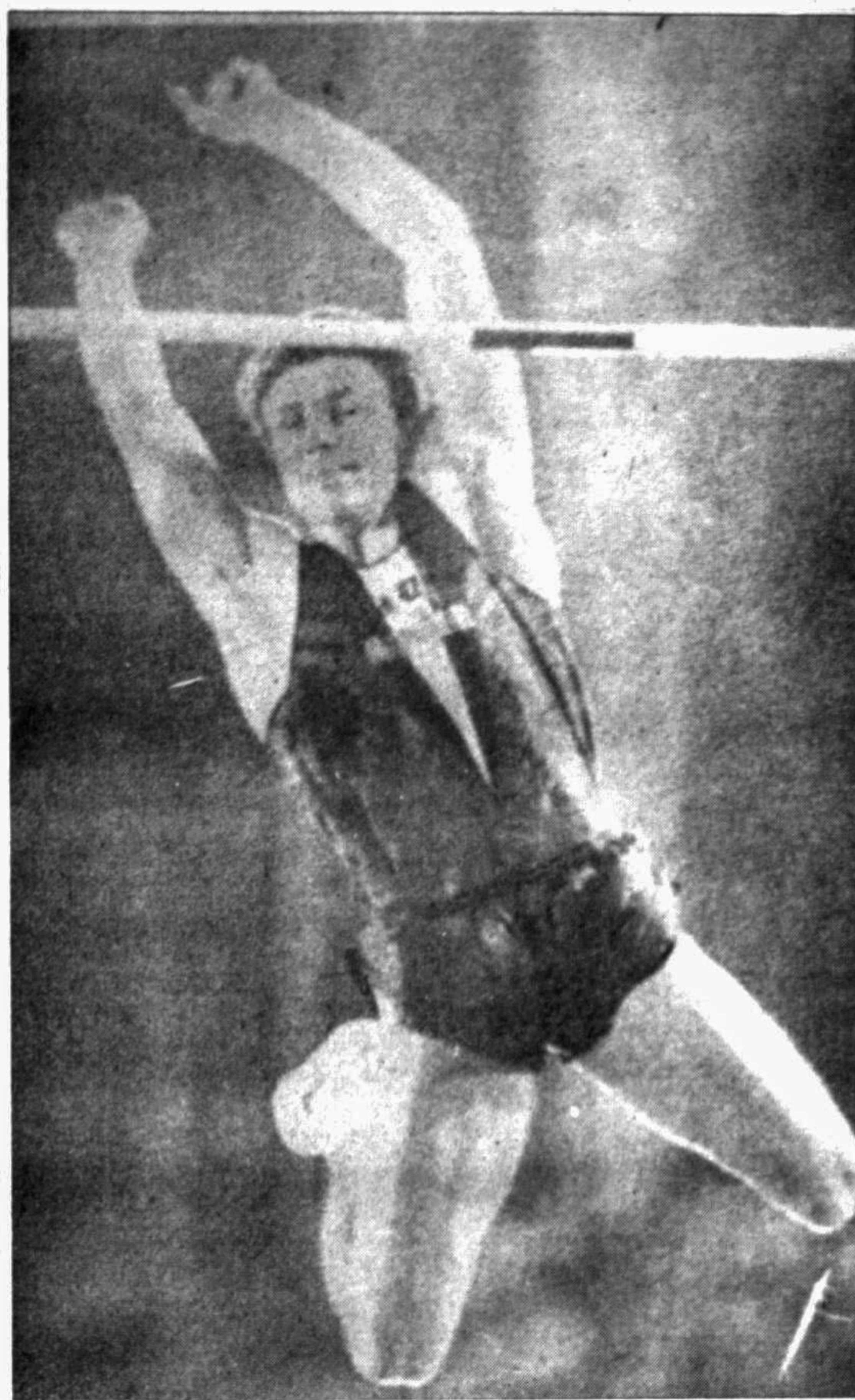
Ukrainian Sergey Bubka easily clears 6.13 metres to break his own world outdoor pole vault record at the Tokyo Super International track and field meet yesterday.

Sixteen teams are taking part in the knockout meet organised by the Jhenidah District Sports Association.