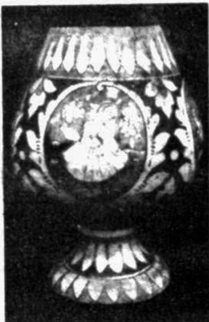
A flower vase used by the Nawabs is on display at the Ahsan Manzil Museum.

And now with the renovated pink-colour mansion on the 4.96 acres of land and 23 galleries inside, the Ahsan Manzil Museum stands and boasts of its regained beauty.