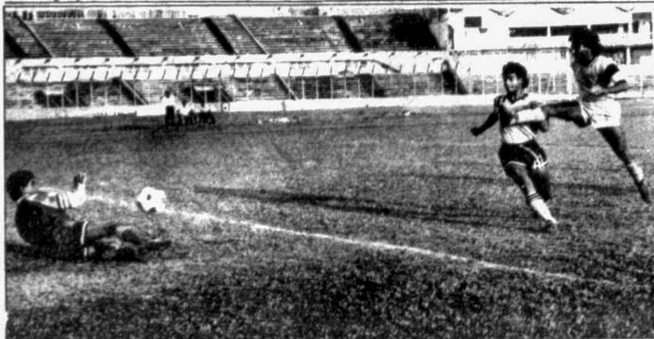
The East Bengal Sporting Club custodian makes a spectacular save to thwart a Malibagh attack in yesterday's Sonali Bank Second Division football league match at the Dhaka Stadium. Malibagh Avijatrik still edged past East Bengal 2-1.

The result put Vasco, who have not conceded a goal in their six games in the competition, level on points with Fluminense, who lead the first stage on goal difference.