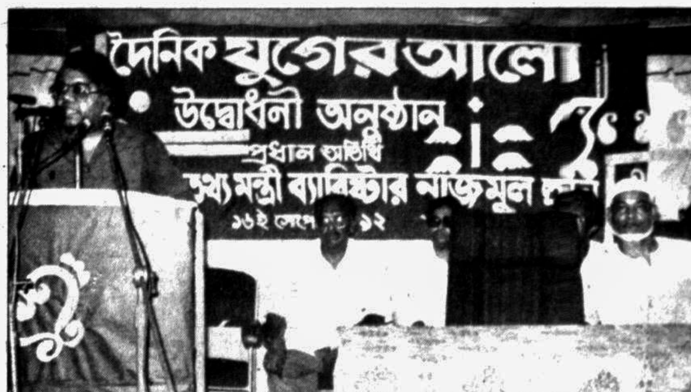
Information Minister Barrister Nazmul Huda addressing the inaugural ceremony of the daily Juger Alo in Rangpur Wednesday.