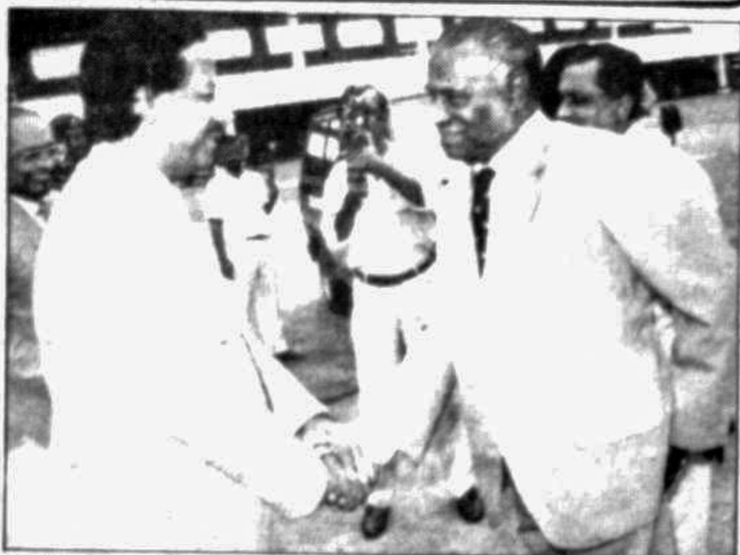
Sri Lankan Minister for Tourism and Rural Development S Thondaman was received by State Minister for Civil Aviation and Tourism Abdul Mannan at the Zia International Airport yesterday.

According to a CMP press release, acting on secret information the detectives raided a godown at Agrabad and found a stock of electric poles, electric metres,