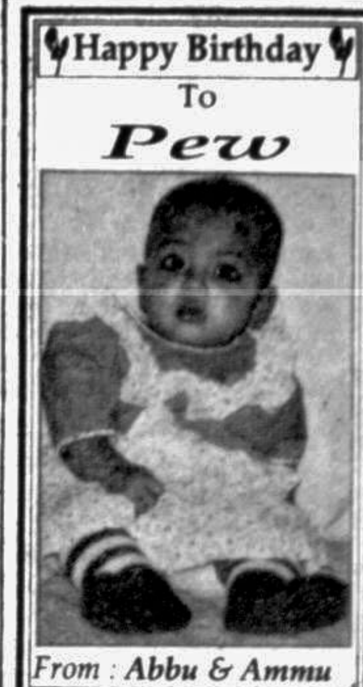
From: Abbu & Ammu

The council session of the left-leaning student organisation concluded with determination expressed for continuing struggle to help establish socialism in the country.