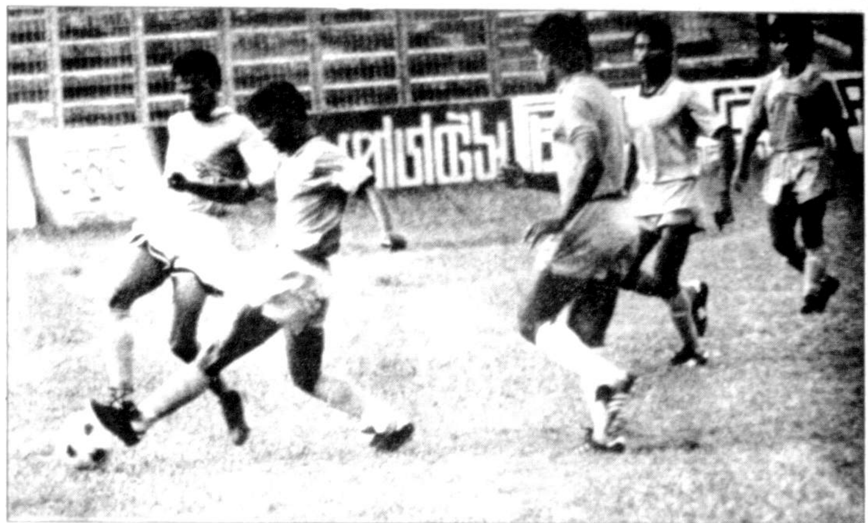
Players fighting for possession in the Sonali Bank Second Division football league match between WASA and BG Press at the Dhaka Stadium yesterday. The match ended in a two-all draw.