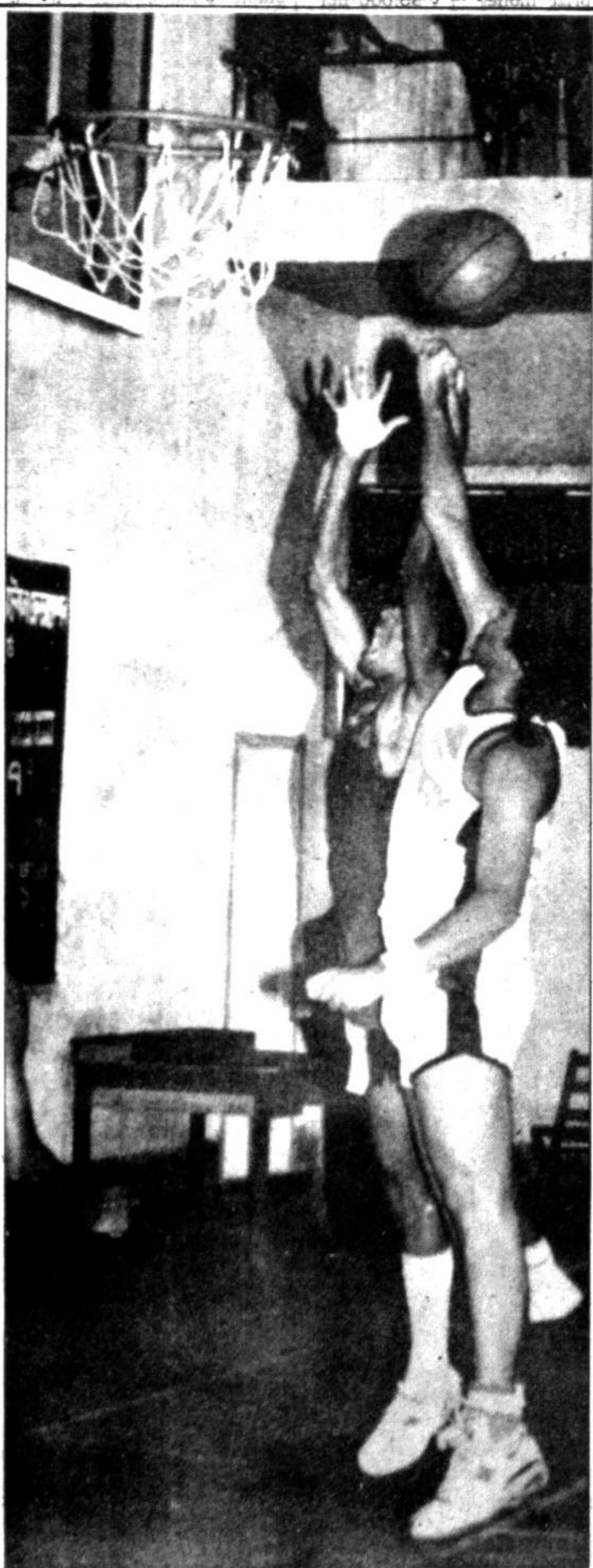
An exciting moment from yesterday's Partex First Division basketball league encounter between The Gregs Club and Backstroke Boys Club at the wooden-floor gym yesterday. Gregs won 108-75.

He played for Argentina in the last three World Cups and was its captain when it won in 1986 and finished second to West Germany in 1990.